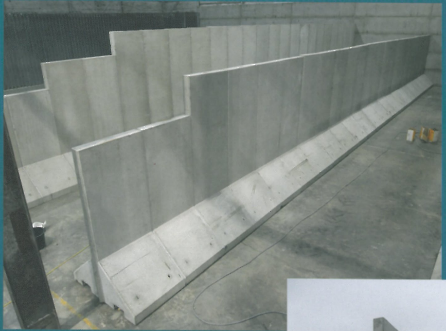
Completed storage bunkers with 3.6m, 3.0m and 2.4m high Arrow panels.