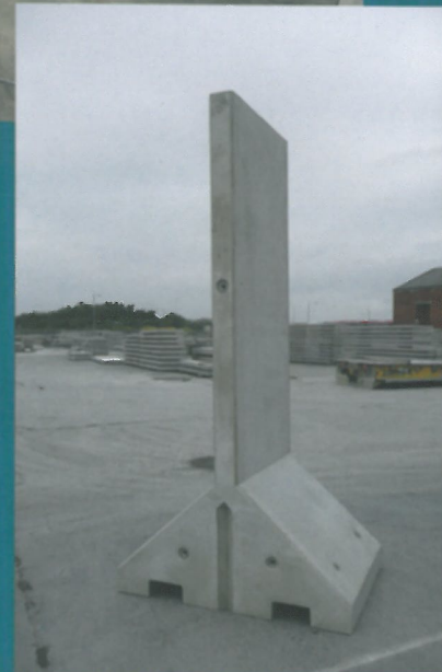
Positive panel-to-panel connection with the tongue and groove base joint system.