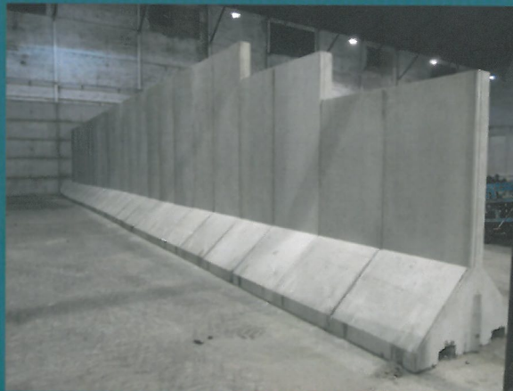
ACP Arrow Panels minimize wasted space and maximise flexibility.