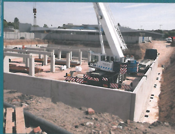
Precast column and beam roof supports with R35 wall panels