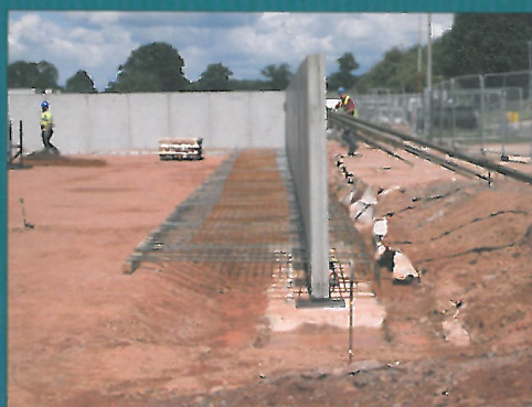
Installation of prestressed vertical cantilever panels