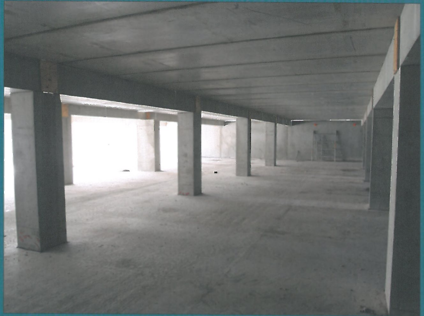
Below ground liquid storage tank constructed with R35 wall panels and precast roof.