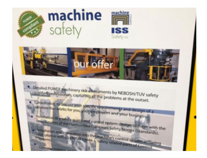
Machine Safety - it's what we do

For more information about our products and services or to arrange a visit please contact <a href="mailto:info@machinesafety.org.uk">info@machinesafety.org.uk</a> or visit <a href="machinesafety.org.uk">machinesafety.org.uk</a>.