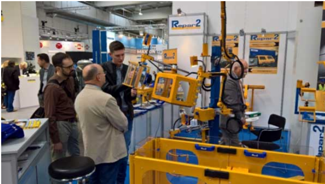
Major and minor chuck guards on display at the stand