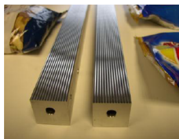
Crimped profile sealing jaws matching pair. Normal size 25mm x 650mm but can be anywhere from 5mm up to 25mm wide x 650mm long.