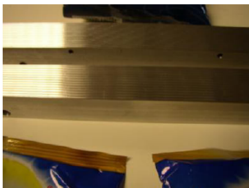
Ground flat sealing bars

Options: Footswitch. PVC Dust cover. Up-grade to digital pressure readout with calibrated pressure transducer. Up-grade to digital dwell timer. Alarm package for temperature over and under band (selectable). Pressure High/ Low alarm. When alarm activated audible alarm sounds and inhibit of sealing initiated. Crimp profiled slide-on jaws 120 deg x 1.8 mm pitch. Cold Seal Option (temperature circuit removed) supplied with flat or crimp profiled jaws. Teflon coated tape or permanent Teflon coating Digital thermometer and s/s band probe to check the actual temperatures of sealing Jaw.