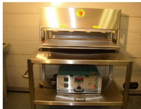
Control panel and sealing head mounted to stainless steel trolley (optional)