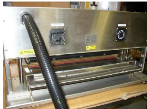
Rear of machine wing ABS electrical conduit connection