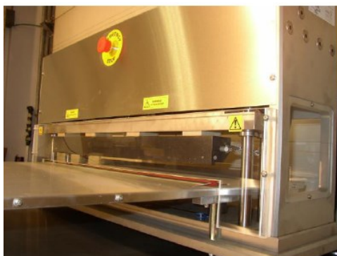
Enclosed construction with guided sealing bar