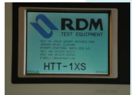
Boot up screen showing model and version