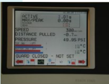
Default screen showing results and settings

Options available: Crimp jaws 25 x 50mm, 120 deg x 1.8mm pitch. Teflon coating to sealing jaws. Silicone rubber covered lower jaw. Drop weight set.