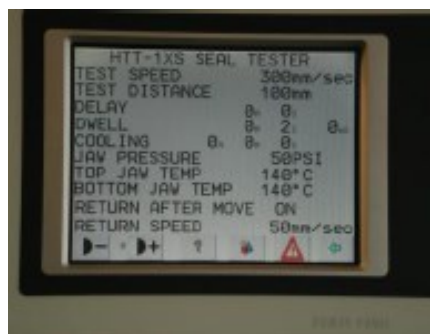
Setup screen, password protected