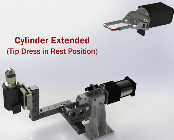
Cylinder Extended (Tip Dress in Rest Position)

Safety Note: Customer is responsible for the safe operation and use of the products shown in this literature. Install guarding as necessary.