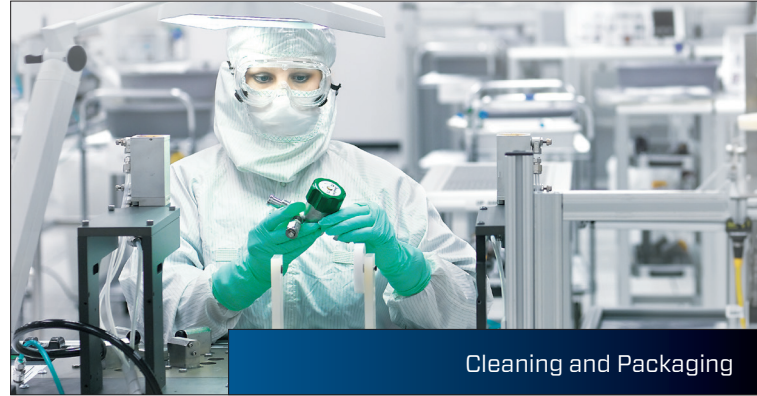
Cleaning and Packaging