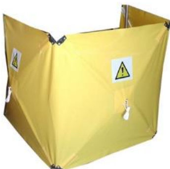
Work Area Screening