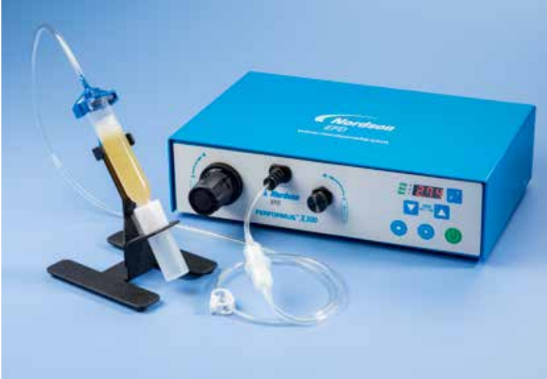
Performus X dispensers provide reliable dispensing for general applications in a wide range of industries.

Reliable benchtop fluid dispensing control for general applications