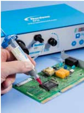
Dispensing SolderPlus® solder paste on PCB boards.