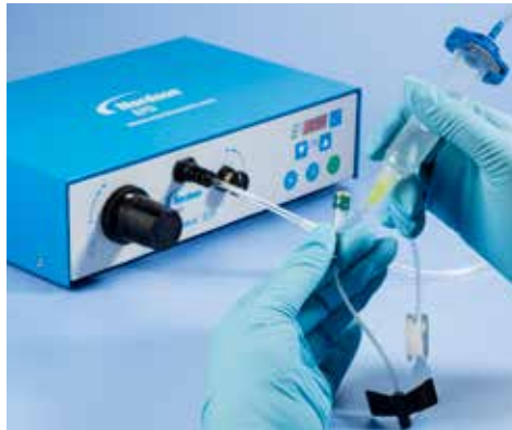
Dispensing a low-viscosity solvent on medical devices.

Nordson EFD's Performus™ X dispensers increase throughput, improve yields, and reduce production costs through controlled application of adhesives, lubricants, and other assembly fluids.