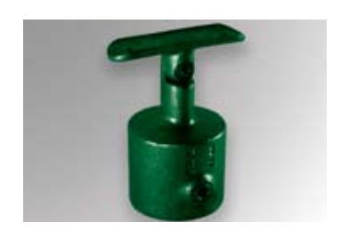
In-Line Top Rail 555-8