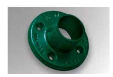
Wall Flange 561-7