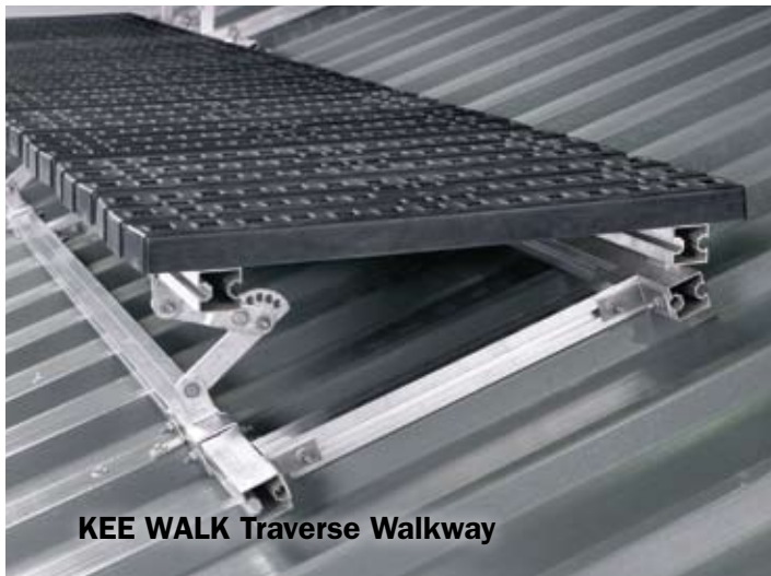
KEE WALK Traverse Walkway

Supplied pre-assembled by Kee Safety to facilitate rapid on-site installation and thus minimise installation costs, these standard lengths have 12 treads per 3m. Weighing only 24kg, the standard lengths are easily positioned and aligned. They are joined together by a simple 100mm long straight connector which attaches to the bearer bars.