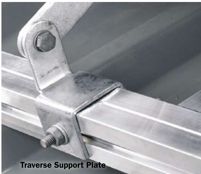
Traverse Support Plate

KEE WALK is designed to make the task of building a walkway across a sloping roof a straight forward installation, again using a standard set of components. A traverse section of walkway uses a standard KEE WALK section for the level walking surface which is mounted onto a sub-frame fixed to the roof. The two sections are joined with hinged brackets at the rear of the assembly and use the rotating arms at the front to level the walking surface, as depicted on the adjacent photograph.