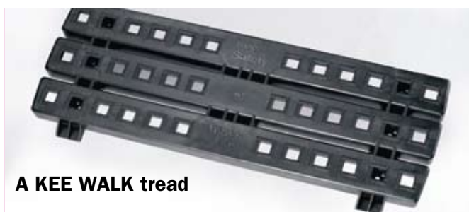
A KEE WALK tread

Manufactured in high grade nylon incorporating raised roughened sections, the treads are developed to comply with EN 516 (Prefabricated Accessories for Roofing – Installations for roof access – Walkways, treads and steps), exceeding the deflection criteria and slip resistance requirements of the standard.