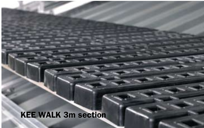
KEE WALK 3m section

KEE WALK provides a flexible, easy to assemble walkway system designed for use on most modern roof types. To demonstrate the flexibility of the system, a brief explanation of the key constituent parts; the longitudinal configuration, the configuration to traverse a roof, the step configuration and the treads is given below. The anti-slip characteristics of the walkway are essential for user safety. The British Standard (BS 4592) requires a minimum co-efficient of 0.4 as a measure of the friction and KEE WALK achieves almost double this in both wet and dry conditions. Specific fixing packs are supplied for the different roof types.