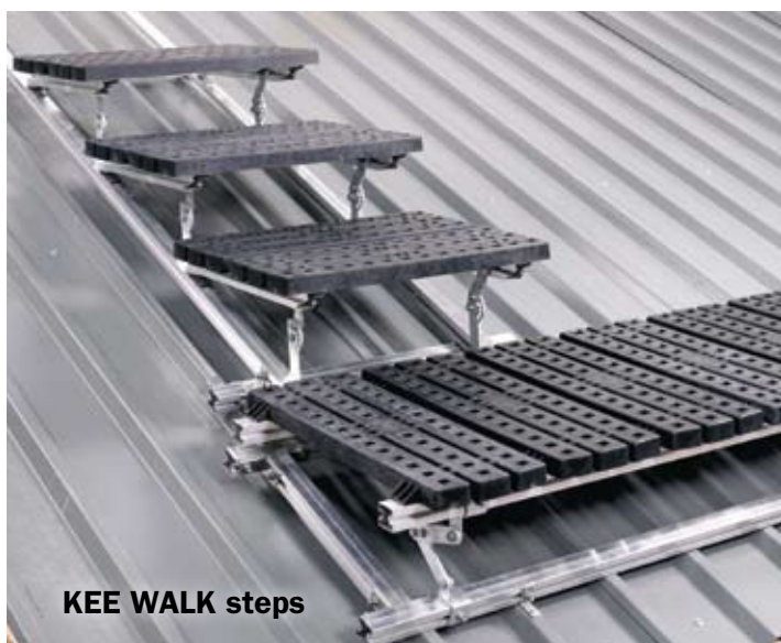
KEE WALK steps

Kee Safety provides pre-assembled step configurations in 3m or 1.5m lengths which require only minor adjustment on-site. The rotating arms (shown above) allow the installer to set the angle of the steps simply by removing the locating bolt, setting the horizontal angle and then replacing the bolt. The steps configurations will change depending on the pitch of the roof. Standard components are available for 5° - 10°, 10° - 15°, 15° - 25°, 25° - 35°, all which comply with the requirements of EN 516. Kee Safety can provide specific information on all the different step configurations as required.