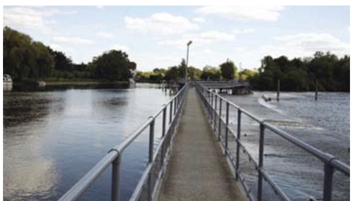
Hambledon Weir, UK