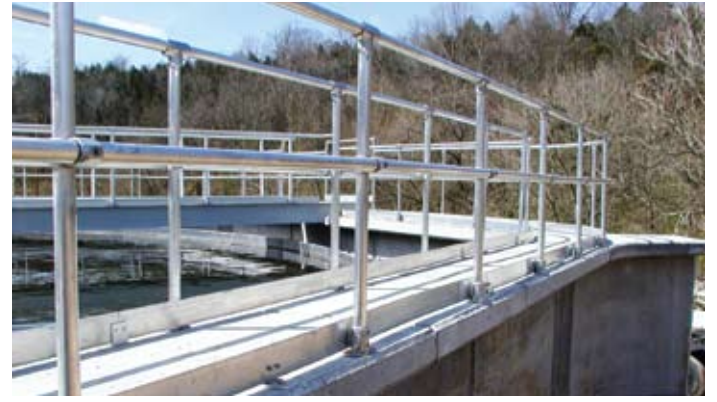
Tennessee, United States