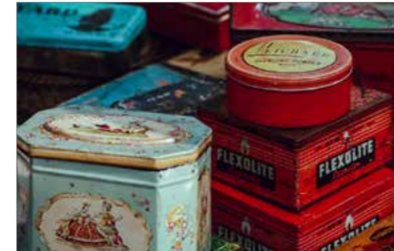
Design & Print 6-7