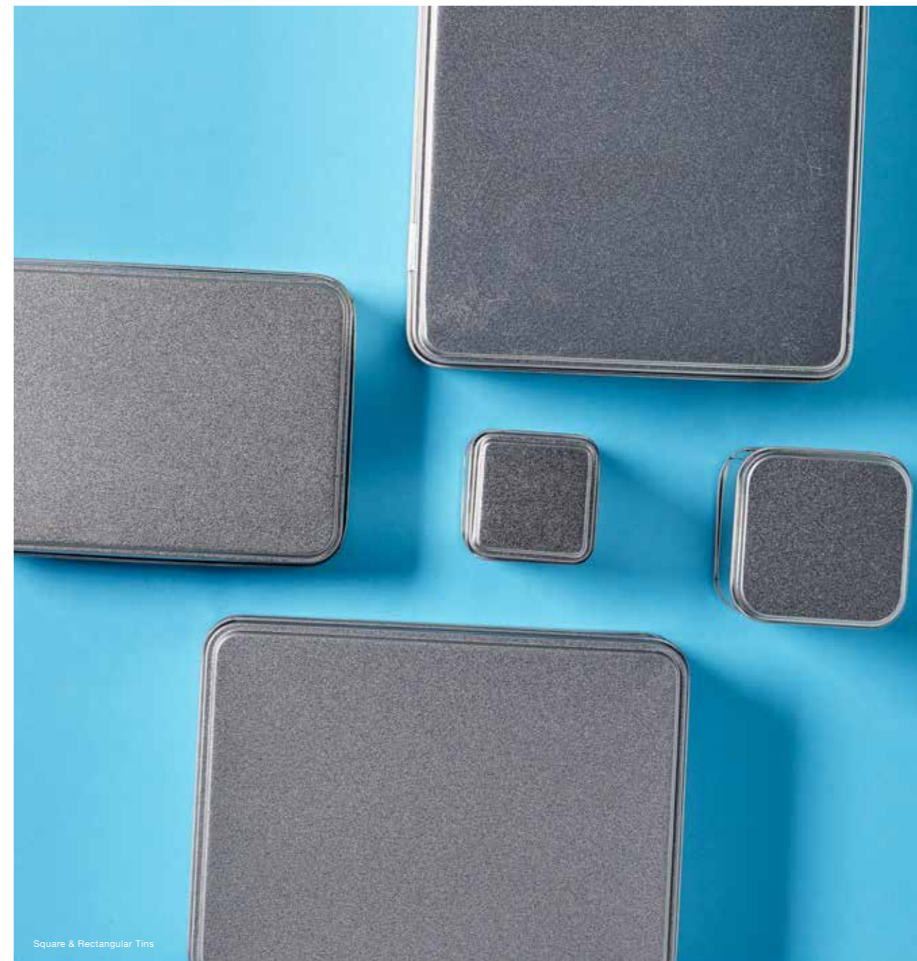
Small text at the bottom left of the tinplate image: Square & Rectangular Tins