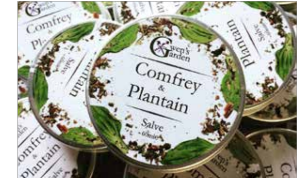
Aluminium Tins 13-15