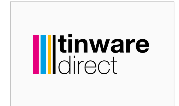
How to Order 28-29