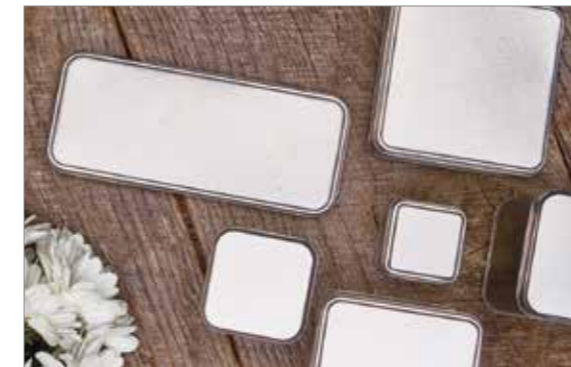
Tinplate Tins 17-23