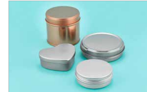
Why Tin? 10-11