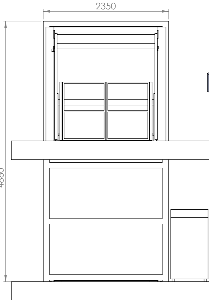
J-J (1 : 37)