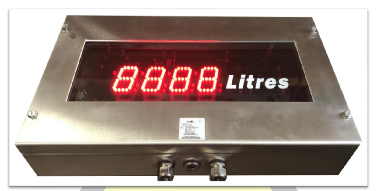
We can customise in many ways such as adding a units of measure label to give the numbers some meaning

All equipment used in hazardous areas must be marked legibly and indelibly with a specific set of letters and numbers. Together, these letters and numbers specify the exact criteria that a product meets and determines the type of environment it is safe to operate in.