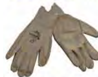
Polyflex Gloves Sizes 8, 9, 10