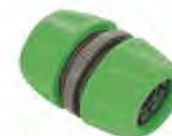
Hose Repair Connector