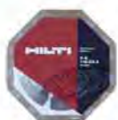
Hilti General Purpose Blade