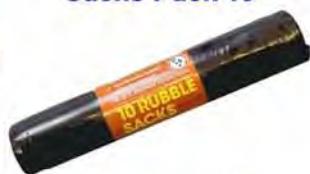
Heavy Duty Rubble Sacks Pack 10