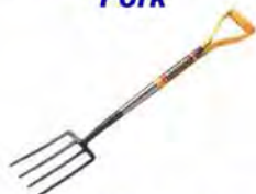
Bulldog Digging Fork