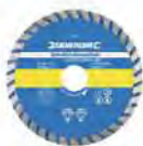
Value Turbowave Blade