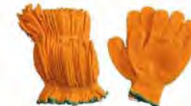
Yellow Grippa Gloves - Pack 12