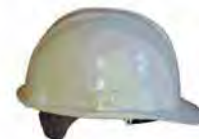
White Safety Helmet