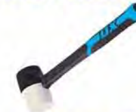
Ox Trade Combination Rubber Mallet 16oz