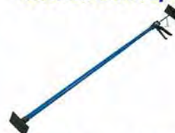
Dust Sheet Prop