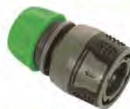
Push On Tap Connector