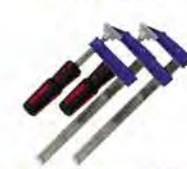
150 x 50mm F-Clamp