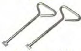
Manhole Keys Large