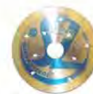
Continuous Rim Tile Cutting Blade