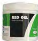
Red Hand Gel Cleaner