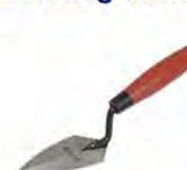
Softgrip Pointing Trowel