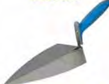
Brick Trowel 280mm