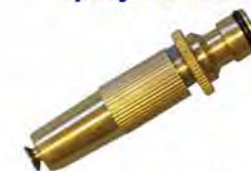
Brass Hose Spray Nozzle