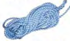
Gin Wheel Pulling Rope 16 mm x 20 Mtr