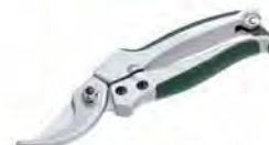
Bulldog Bypass Secateurs