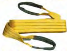
Lifting Sling 3 Tonne x 3 Mtr