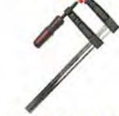
150 x 80mm F-Clamp