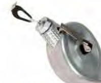
Metal Chalk Line