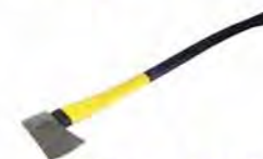
Felling Axe Fiberglass Handle