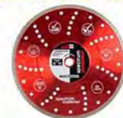
Spectrum TX10R 350mm x 20 Bore

£118.25 / ea + VAT £141.90 / ea (inc VAT)