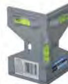
3 Way Post Level