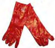
16" PVC Gauntlet