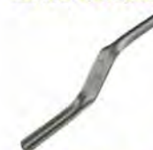
1/2 & 5/8" Stainless Brick Jointer