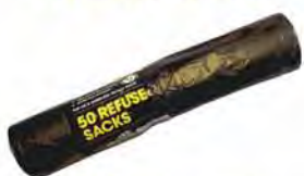
Medium Duty Refuse Sacks Pack 50