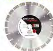
Concrete Cutting 450mm Blade

£287.50 / ea + VAT £345.00 / ea (inc VAT)