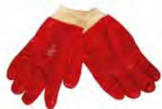
PVC Gloves With Cuff