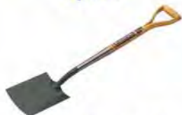
Bulldog Digging Spade