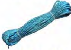
Rope 10 mm x 27 Mtr