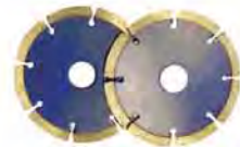
Motor Raking Blade Pack of 2