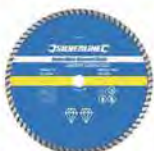
Value Turbowave 230mm Blade