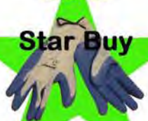
Latex Builders Gloves