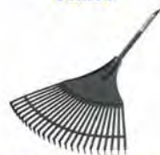
Bulldog Lawn Rake