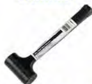
2 lb Deadblow Hammer