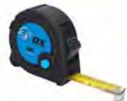
Ox Quality 8 Metre Tape Measure