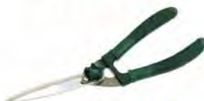
Bulldog Garden Sheers