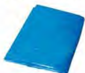
Tarpaulin 3.6 x 4.8 Metre