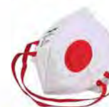
FFP3 Face Mask