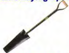
Defiance Builders Cable Laying Spade