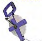
50 Metre Tape Measure