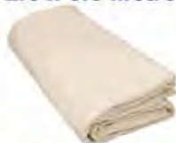
Cotton Dust Sheet 2.6 x 3.5 Metre