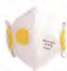
FFP2 Face Mask