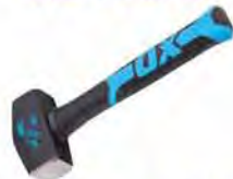
Ox Trade Fiberglass Club Hammer