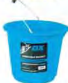
Ox Professional Bucket