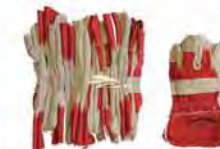
Super Rigger Gloves - Pack 12