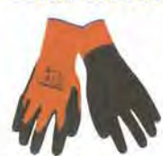
Hi-Viz Orange Latex Gloves