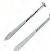
Brick Line Pins