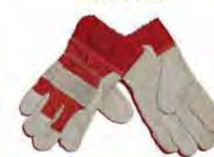
Super Rigger Gloves