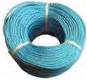
Draw Cord 6 mm x 200 Mtr