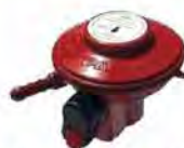
27mm (3/4") Clip On Propane Regulator