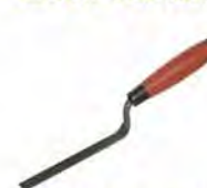
13mm Softgrip Brick Jointer