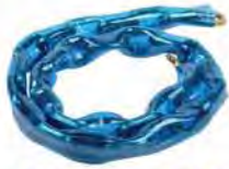
Heavy Duty Security Chain