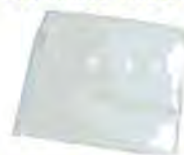
Poly Dust Sheet 3.5 x 3.5 Metre