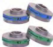
Dust or Vapour Cartridges