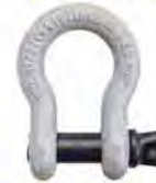
6.5 Tonne Alloy Bow Shackle