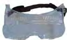
Standard Safety Goggles