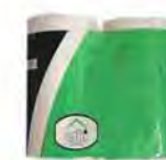
Pack of 4 Toilet Rolls