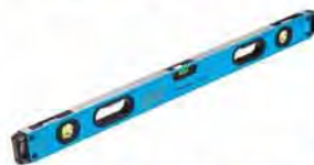
Ox Trade Pro Level 900mm