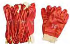
PVC Gloves With Cuff - Pack 12