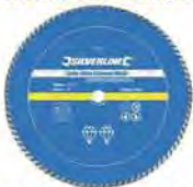
Value Turbowave 300mm Blade