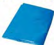
Tarpaulin 3.6 x 6.1 Metre