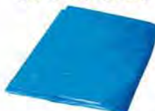
Tarpaulin 4.8 x 6.1 Metre