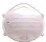
FFP1 Face Mask