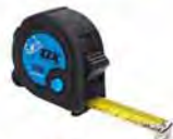
Ox Quality 5 Metre Tape Measure