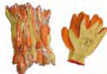
Yellow Gripper Gloves - Pack 12