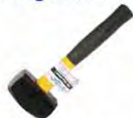
1kg Club Hammer Fibreglass Handle