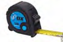
Ox Trade 5m Tape Measure