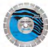
Abrasive & Tarmac 230mm Blade