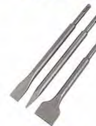
Point, Chisel & Bolster Set