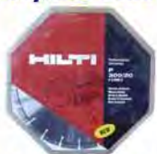
Hilti General Purpose Blade