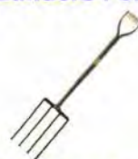
Defiance Builders Fork