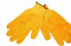
Yellow Grippa Gloves