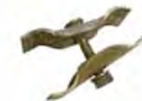
Fence Panel Clip