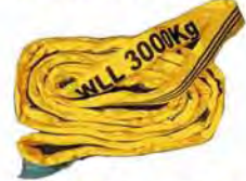
Lifting Round Sling 3 Tonne x 2.5 Mtr