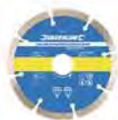
Silverline Economy Blade