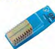
Ox Trade 25mm pk 4 Scutch Combs