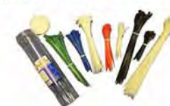
Assorted Cable Ties (Other sizes available)