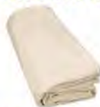
Poly Lined Dust Sheet 2.4 x 3.6 Metre