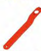
Angle Grinder Spanner