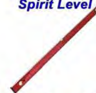
1800mm Long Spirit Level