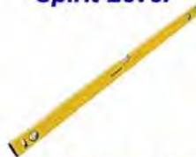
1200mm Long Spirit Level