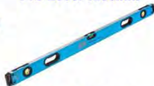
Ox Trade Pro Level 1200mm