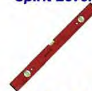
1200mm Long Spirit Level