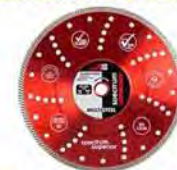
Spectrum TX10R 350mm x 25 Bore

£118.25 / ea + VAT £141.90 / ea (inc VAT)