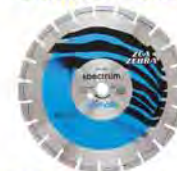
Abrasive & Tarmac 450mm Blade

£287.50 / ea + VAT £345.00 / ea (inc VAT)