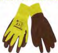
Hi-Viz Yellow Latex Thermal Gloves