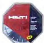
Hilti General Purpose Blade