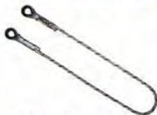
Fixed Lanyard 1.5 & 2.0 Mtr