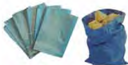
Heavy Duty Canvas Sacks Pack 5