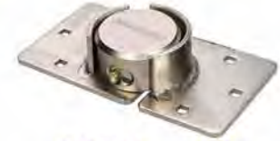
Van Security Lock