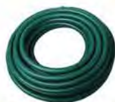
Green Garden Hose 12.5 mm x 30 Mtr