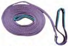
Lifting Sling 1 Tonne x 6 Mtr