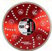
Spectrum TX10R All Material Blade