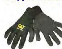
CAT Branded Gripper Gloves