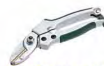
Bulldog Anvil Secateurs