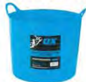
Ox Trade Flexi Gorilla Tub 42 ltr