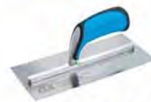
Ox Trade 280mm Plaster Trowel