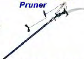
Long Handled Pruner