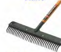
Bulldog Wizard Rake