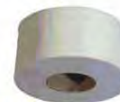
2 Ply Toilet Roll 200 Mtr

£4.95 / roll + VAT £5.94 / roll (inc VAT)