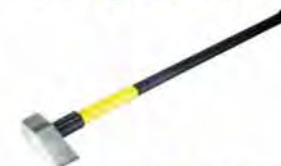
Log Splitting Axe Fiberglass Handle