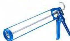
Ox Trade Pro Sealant Gun