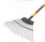
Bulldog Grass Rake