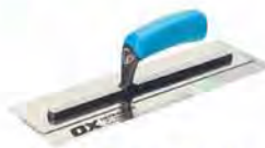
Ox Trade 356mm Plaster Trowel