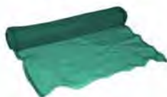
Debris Netting 2 x 50 Metre