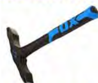
Ox Trade Double Ended Scutch Hammer