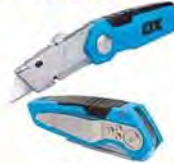
Ox Trade Folding Knife