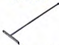
All Steel Tarmac Rake