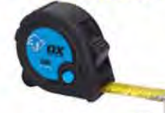
Ox Trade 8m Tape Measure