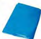
Tarpaulin 3.0 x 3.6 Metre