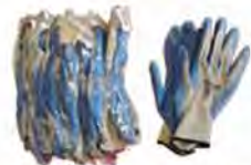
Latex Builders Gloves - Pack 10