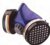
Cartridge Respirator Holder