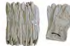
Standard Rigger Gloves Pack 12