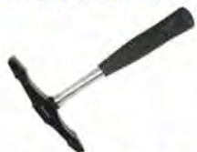
Double End Scutch Hammer