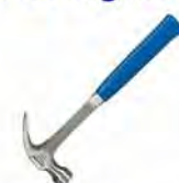
Claw Hammer Solid Forged Shaft