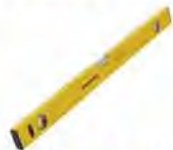
900mm Long Spirit Level