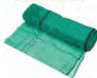
Debris Netting 3 x 50 Metre