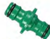
Double Male Hose Connector