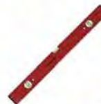
900mm Long Spirit Level