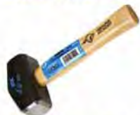
Ox Trade Hickory Club Hammer