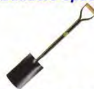
Defiance Builders Spade