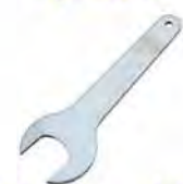
Gas Bottle Spanner