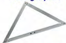
Builders 1200 mm Folding Square