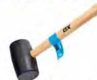
Ox Trade Rubber Mallet 16oz