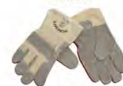
Standard Rigger Gloves