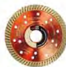
Spectrum TX10R All Material Blade