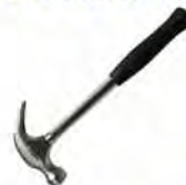
Claw Hammer Tubular Shaft