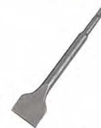
SDS Plus Bolster