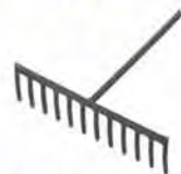
Bulldog Standard Rake