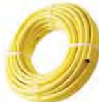
Yellow PVC Hose 12.5 mm x 30 Mtr