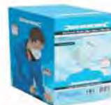
FFP2 Face Mask Box 10