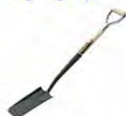
Bulldog Cable Laying Spade