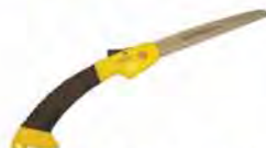
Faithfull Folding Hand Saw