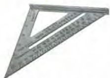
Alloy Roofing Square