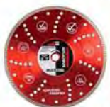
Spectrum TX10R All Material Blade