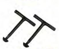
Manhole Keys Small