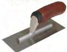
Softgrip Plastering Trowel/Float