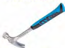
Ox Trade Pro Claw Hammer