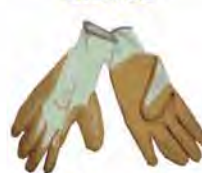
Yellow Gripper Gloves