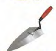
Brick Trowel 200mm