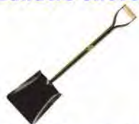
Defiance Metal Handled Builders Shovel