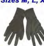
Poly Gloves EN388 CAT II Rated Sizes M, L, XL