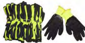
Hi-Viz Thermal Gloves - Pack 12