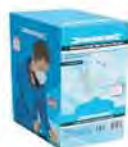
FFP1 Face Mask Box 20