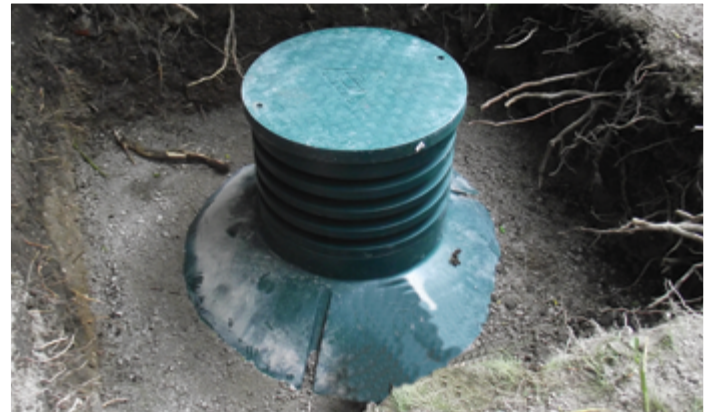
Turret invert extension during installation

The Diamond range offers one of the widest choices for invert extensions giving complete flexibility for different site conditions and installation requirements. This can enable alignment to existing pipework.