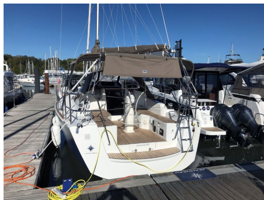
Bimini with Backstays

Tecsew Limited Unit E3 Eagle Building Daedalus Park Daedalus Drive Lee-on-Solent GOSPORT Hampshire PO13 9FX