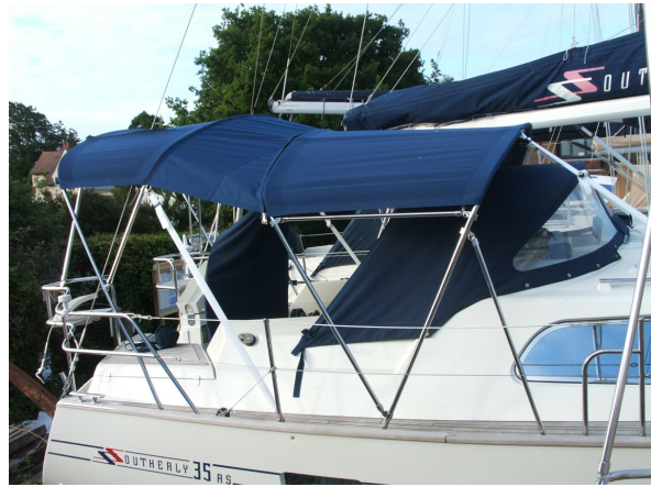
2 Part and 3 Part Biminis