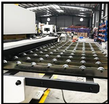
Coil Output Support