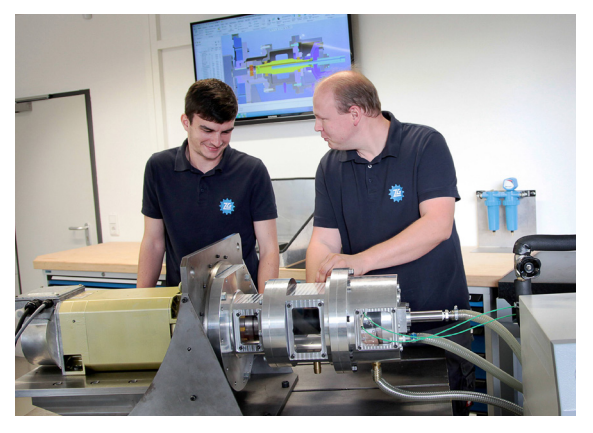
>> Modular Test Rig