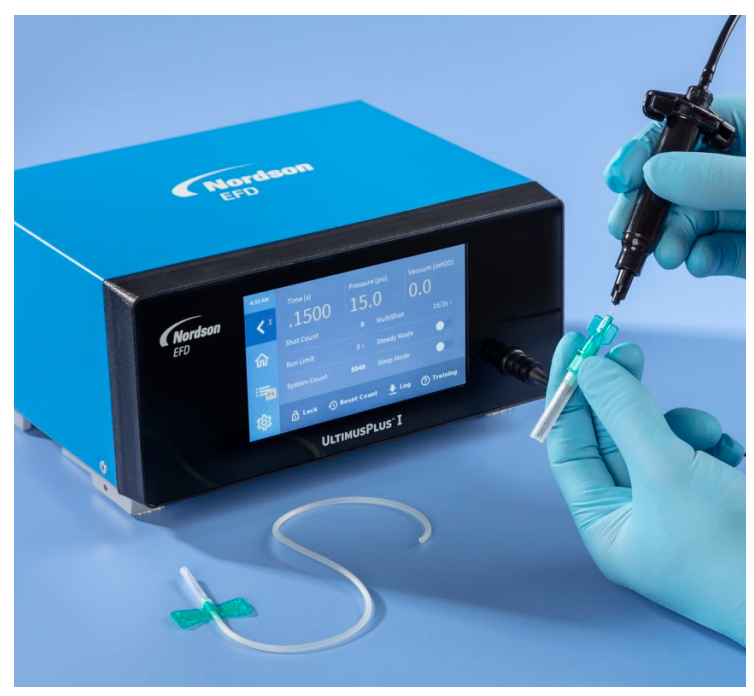
Experience market-leading usability with an intuitive touchscreen interface that simplifies setup and programming.

Improved usability and intuitive dispensing control