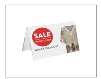
Table Tent for Name Cards Acrylic £1.68

This is a clear acrylic tent shaped card holder which is perfect to display delegate or guest names at formal conference dinners or similar events. 2mm thick acrylic with polished edges. A8, A7, A6, 1/3 A4 and A5 sizes Product Code AS6