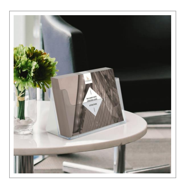
STABLECROFT CONFERENCE PRODUCTS LTD