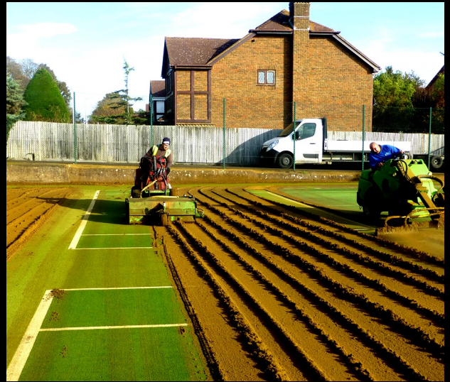
Step 2: Collecting and removing the contaminated infill.