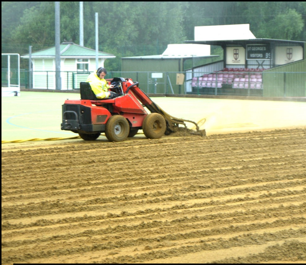
Step 1: Extract the infill using a SSP rejuvenation unit.