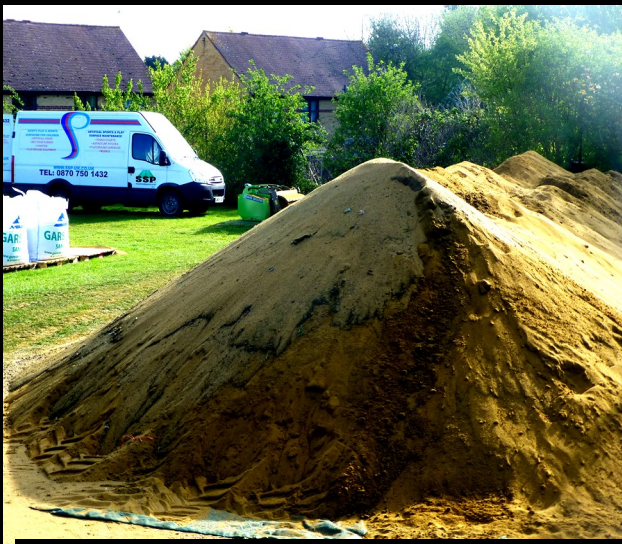
Step 3: The contaminated infill is removed.