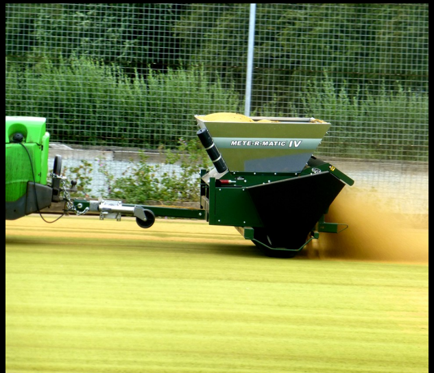
Step 4: Application of new sand infill.

The rejuvenation of an astro turf pitch can restore it to a virtually 'as new' condition, extending its useful life. The rejuvenation process removes the conditions of infill compaction and contamination as well as synthetic grass fold, which leads to problems such as hardening of the surface, flooding, moss and algal growth, as well as slime growth.