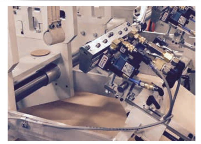
Adhesive Dispensing, Cold Glue & Hot Melt