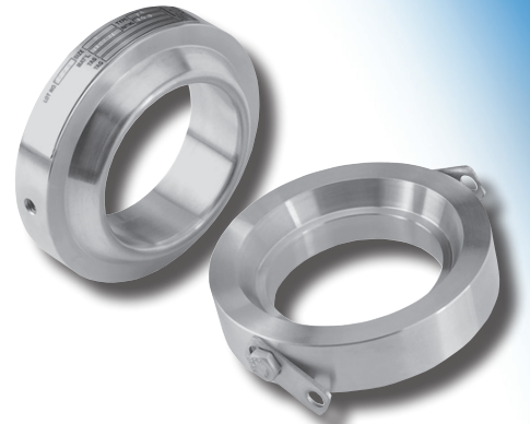
PB Series disk mounts into 7A - Angle Seat disk holder (refer to 7A - Angle Seat data sheet)