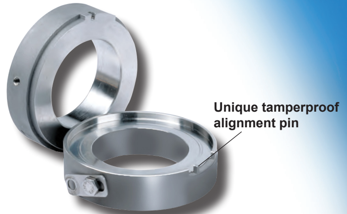
RLP Series disk mounts into RLP-I Series disk holder