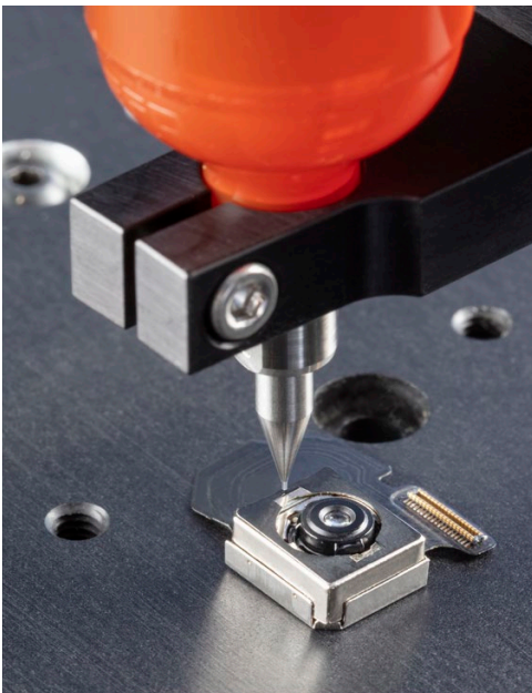
Micro-deposit dispensing onto a compact camera module.