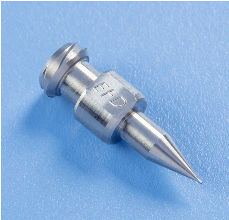
Optimum SmoothFlow stainless steel precision nozzles offer orifice sizes from 100 to 500 \mu\text{m} .

Micro-dispensing for high-precision applications