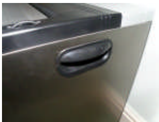
Easy Carry Handle ( Unit Only 22Kg )