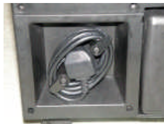
Store Cable in Body