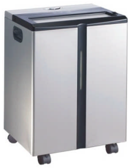
Comfort 40 40 Litre /day dehumidifier

Suitable for use in occupied buildings Smart enough for the home or office Powerful enough for industrial applications