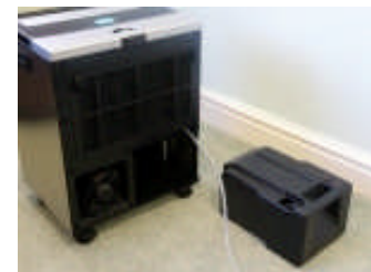
Continuous Drain or Big Tank