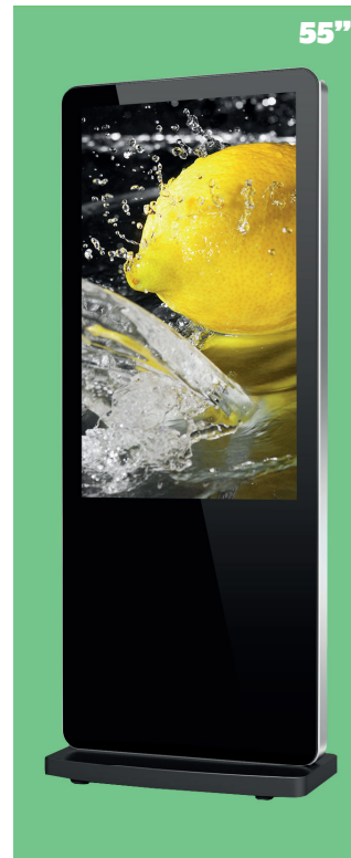
DCP-IINP175337 55" Display

Slimline Freestanding Digital Totem Unit 1960mm high