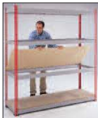
...with framework complete, stockrax put the shelves into position.