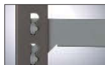
Dark Grey Uprights (GX)