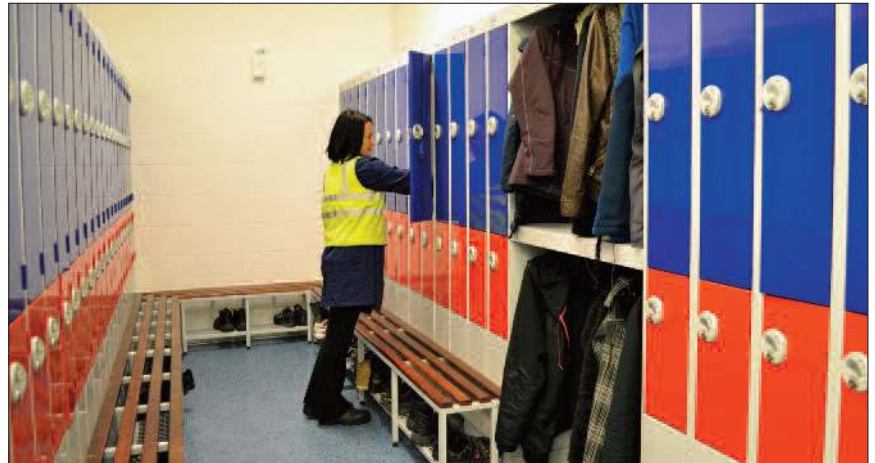
Our steel lockers are available in a wide range of sizes, door configurations, locking options, colours and finishes ensuring staff belongings are safe and secure.