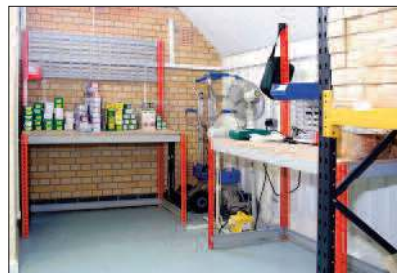
A range of packing and maintenance benches for use throughout production and warehousing operations.