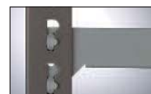
Dark Grey Uprights (GX)