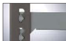
Dark Grey Uprights (GX)