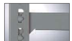
Light Grey Uprights (GU)