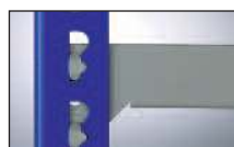
Blue Uprights (GB)