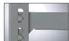
Light Grey Uprights (GU)