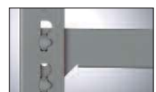
Light Grey Uprights (GU)