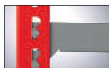
Red Uprights (RD)

Choice of 4 upright colours with Light Grey beams