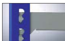
Blue Uprights (GB)