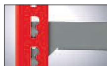
Red Uprights (RD)

Choice of 4 upright colours with Light Grey beams