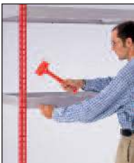
Unpack and assemble framework by simply tapping together...