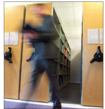
Mobile shelving offers a high density storage solution, making ideal for offices where space is at a premium.