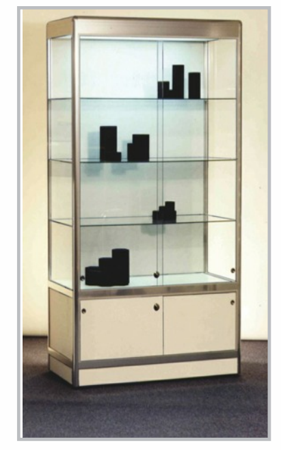
SD 3100 with optional canopy