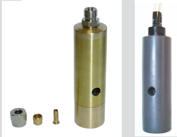
BC2-1 PVC balance chamber