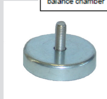
Magnet for Standard balance chamber