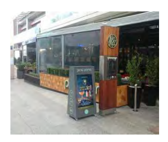
Ping Pong Weather Resistant A-Totem