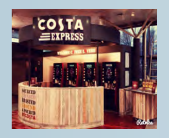
Costa Marlow Bespoke 27"Touch Screen