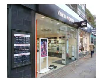
Vision Express Branded Digital Signage