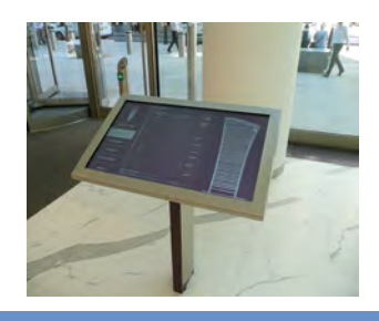
The Walkie Talkie Interactive Touch Screen