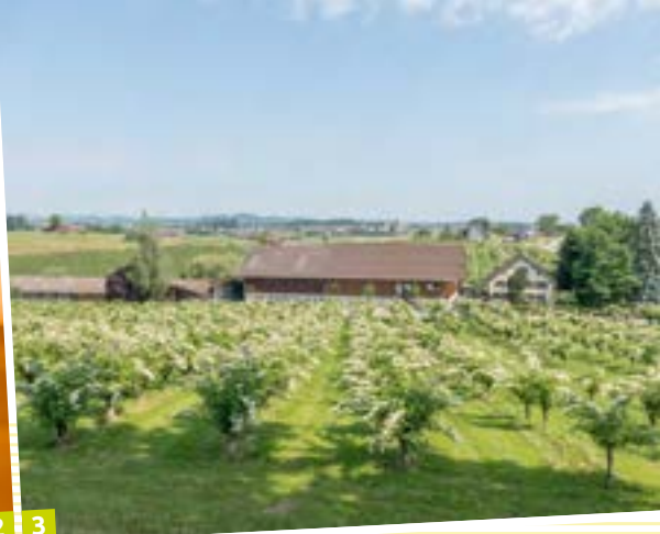
1. the naturally cloudy Engadine beers are produced by hand and with the utmost care. 2. Professional craft beer production: with its state-of-the-art production facility, Brouwerij Anders! also performs contract bottling. 3. Impressive: some 1,600 elder trees on the Holderhof farm in Ufhofen.