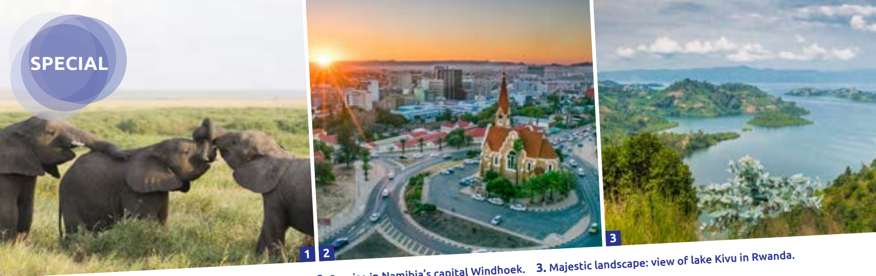
1. Elephants in Amboseli National Park of Kenya. 2. Sunrise in Namibia's capital Windhoek. 3. Majestic landscape: view of lake Kivu in Rwanda.