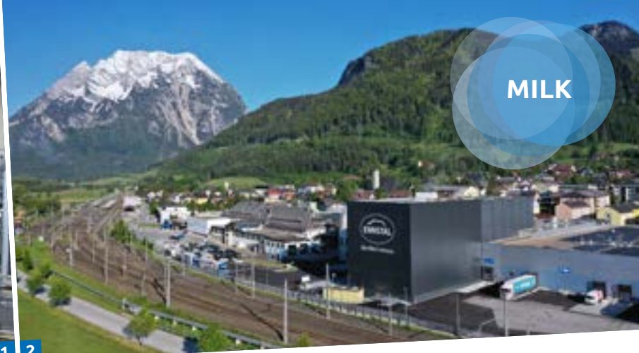
1. reliable self-adhesive labelling for the closure of CartoCan® packaging. 2. Company headquarters of Ennstal Milch KG in Stainach.