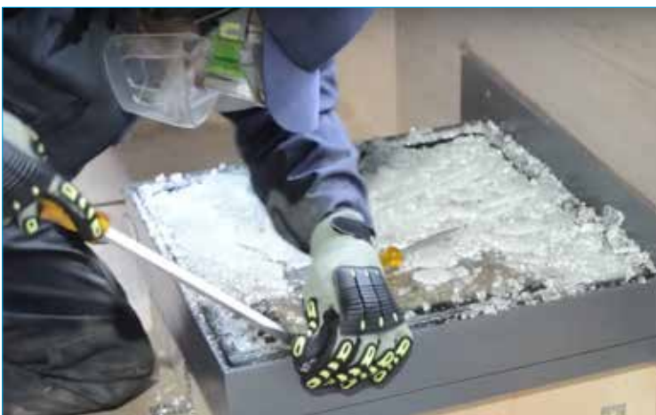
*Testing fixed Flushglaze rooflights in line with part Q building regulations*

LPS 2081 specifically addresses offering resistance to opportunist intruders attempting 'stealth' attacks to gain entry