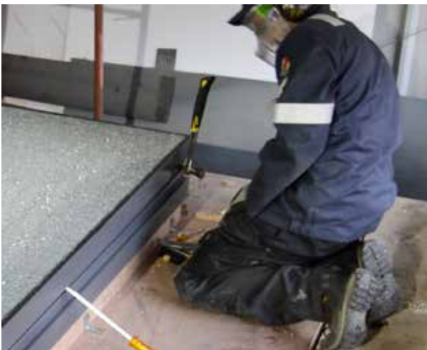
Part Q security testing process on Visionvent opening glass rooflight.

To prevent opening sections being forcibly pried open, it is often better to look for products with dual locking systems at either end, which will make any attempt to open the rooflight much more difficult. Electrically operated and motorized systems should not be possible to be 'back driven'.