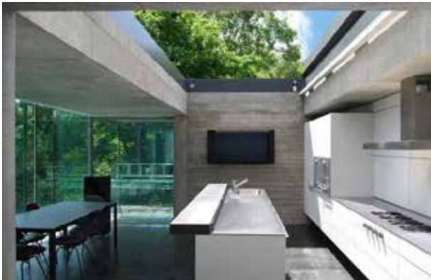
Large opening rooflight on flat roof extension.

As mentioned previously, although Security Rating A is the only required test for the Building Regulations Part Q, a further test using an enhanced set of tools can prolong the attack for up to three minutes; this is then awarded a Security Rating B .