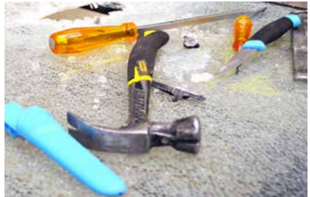
Tools typically used during the security testing process.