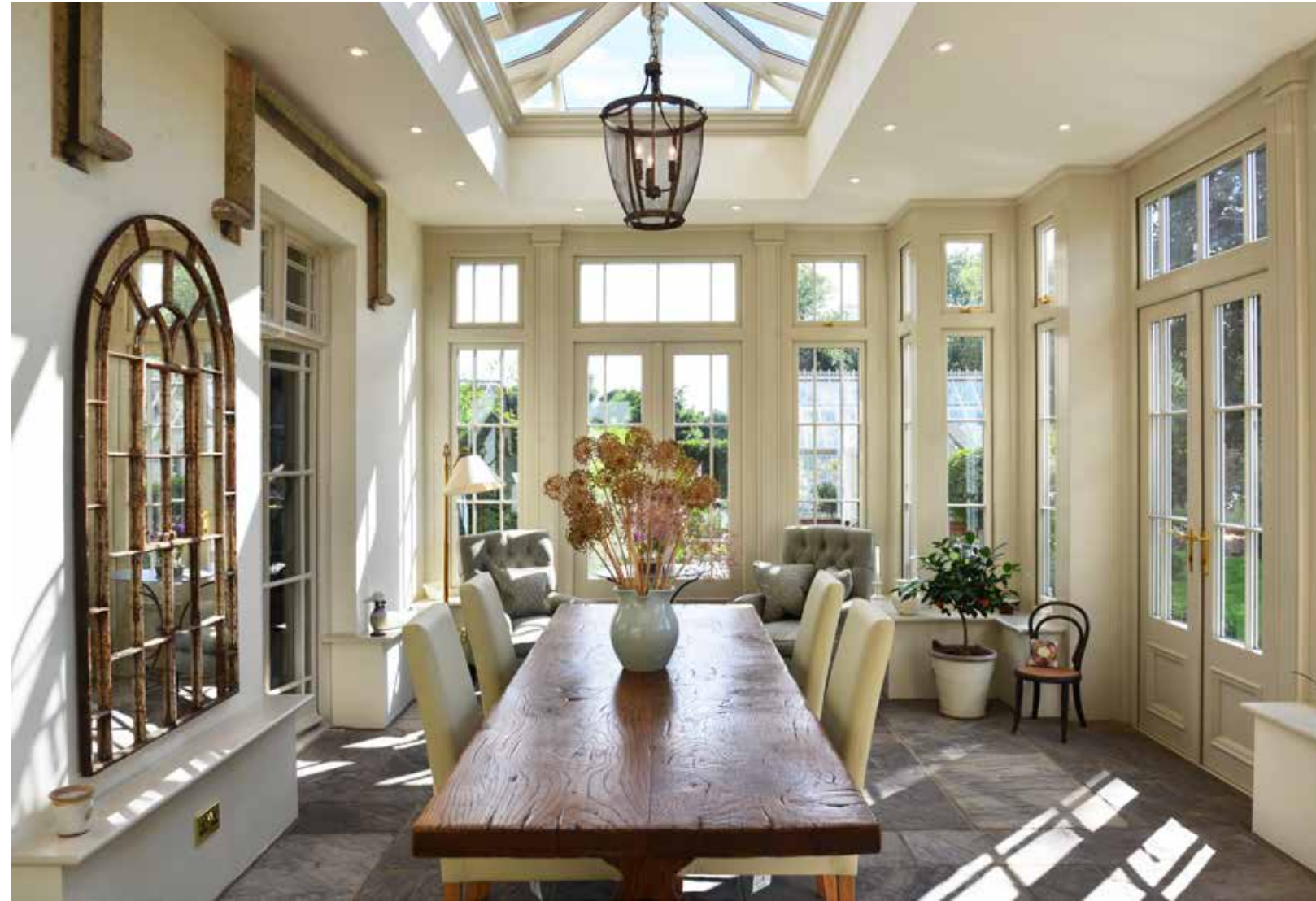
This award-winning painted orangery design complements the client's period brick property, allowing them to feel closer to their beautiful garden and providing views of the river and nearby abbey.