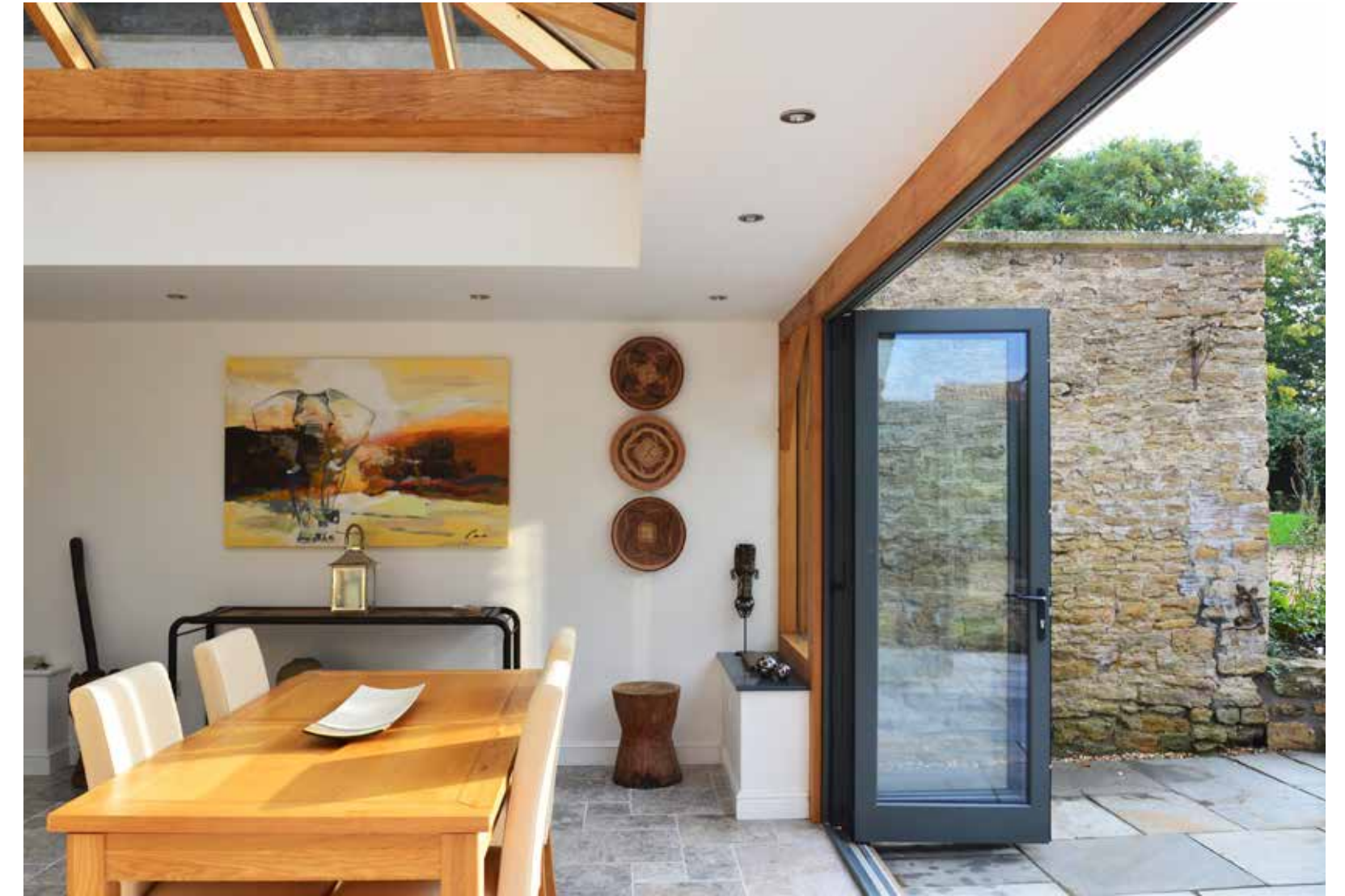
This project perfectly encapsulates the feeling of traditional design with a modern twist, the result is a real feel of the here and now. The gorgeous tones of this oak orangery are perfectly offset by the contemporary grey painted, timber bi-fold doors and windows.