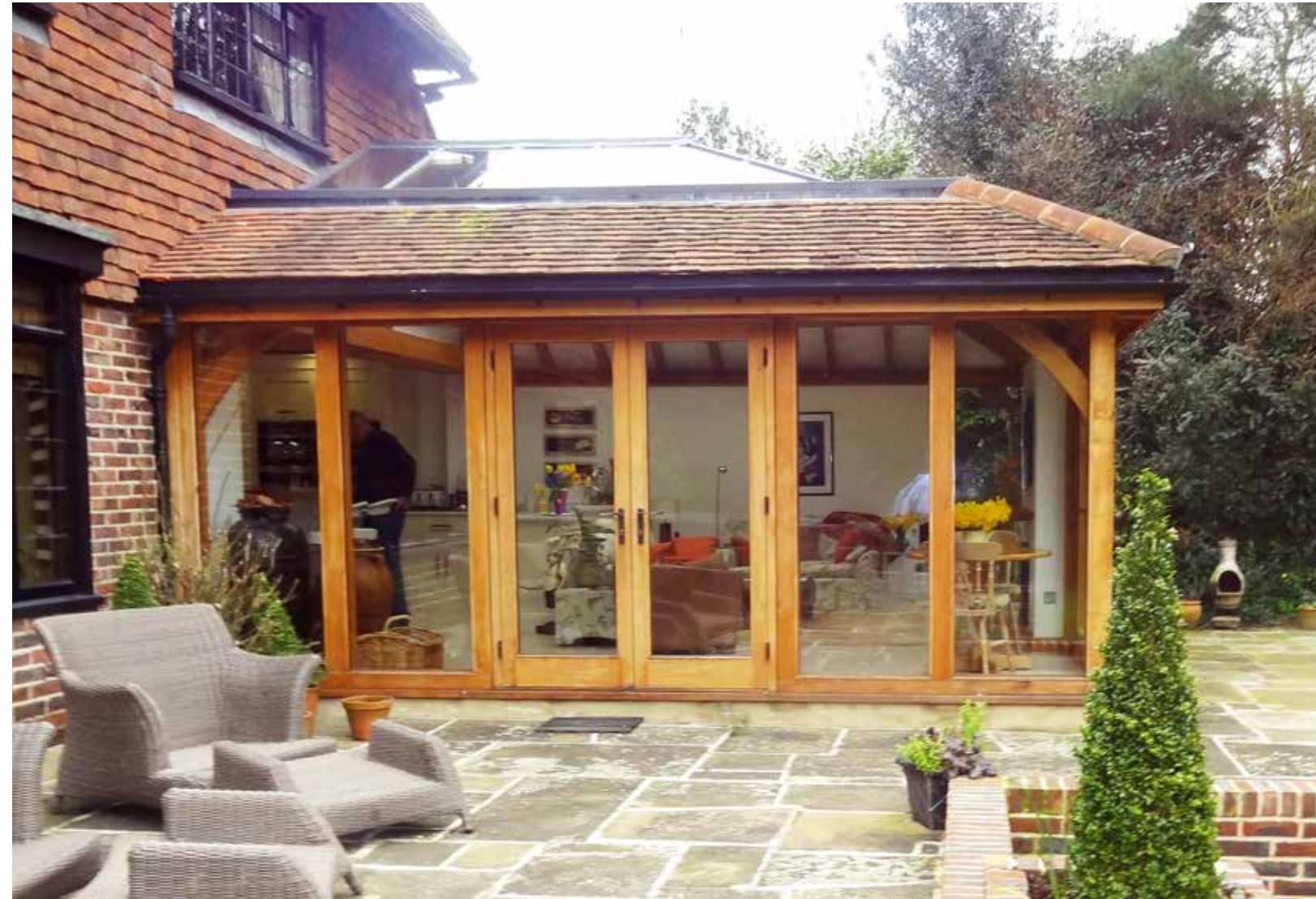
This substantial oak orangery sits perfectly at the back of the house, as if it has always been there. It creates a spacious, bright living space and open-plan kitchen for all to enjoy.