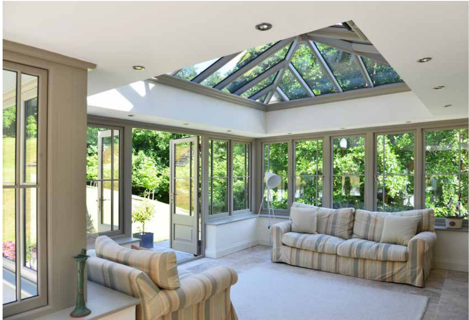
This double orangery extension in the midst of the beautiful rolling Devon countryside provided plenty of space for both living and dining – the best of both worlds. Combined with the windows all around, the result is a lovely light and open plan space to enjoy, whatever the occasion or time of year, with stunning panoramic views.