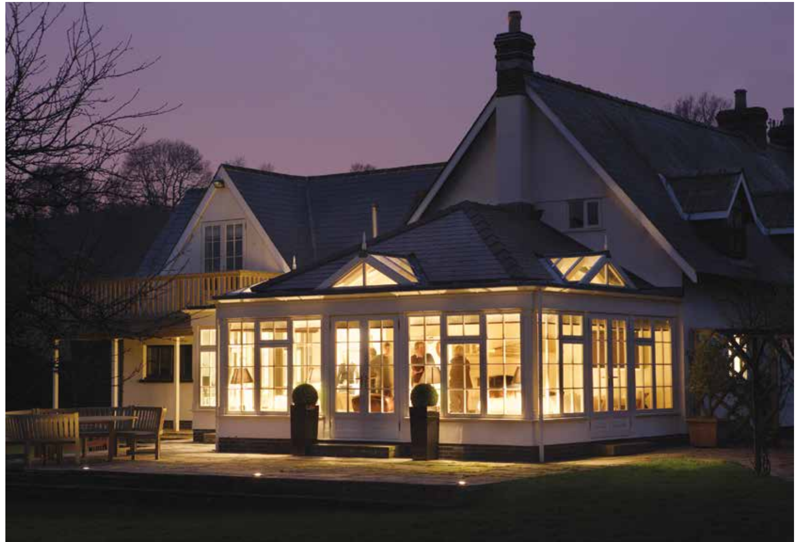
The term 'Garden Room' is used to describe a glazed extension with a tiled roof. This example with exposed roof beams has the advantage of being 'in the garden', while retaining the feel of a traditional living room.