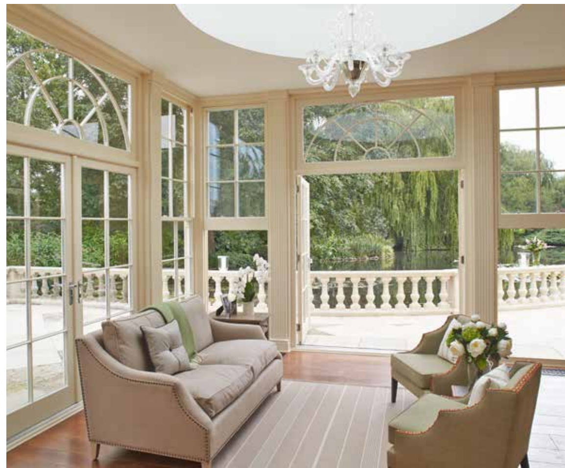
The character of the impressive main house is complemented by the curved-glass domes which command admiration without detracting from the property's impressive historic character. The three light, spacious rooms created (only one shown) provide a variety of living areas and inspiring views of the lake and grounds.