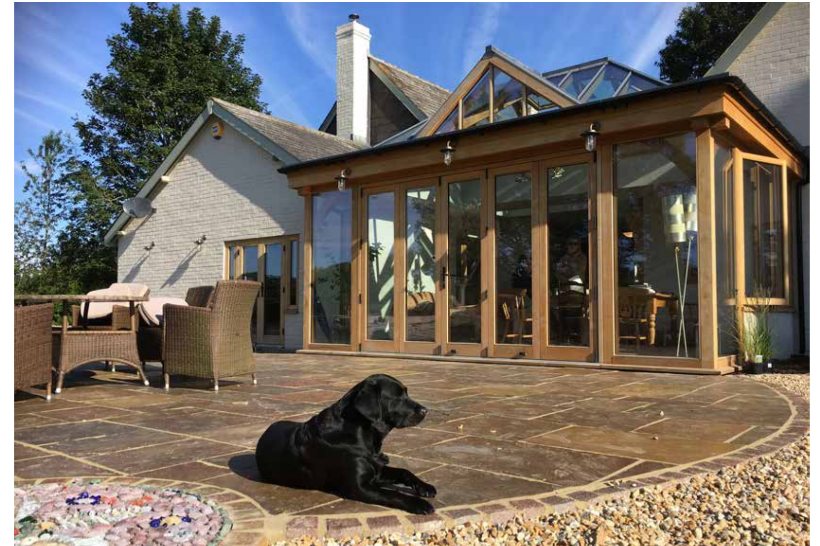
This oak orangery with full height windows and bi-fold doors provided exactly the new living space this client was looking for. The bespoke timber extension has transformed this home and become the favourite room for eating or relaxing.