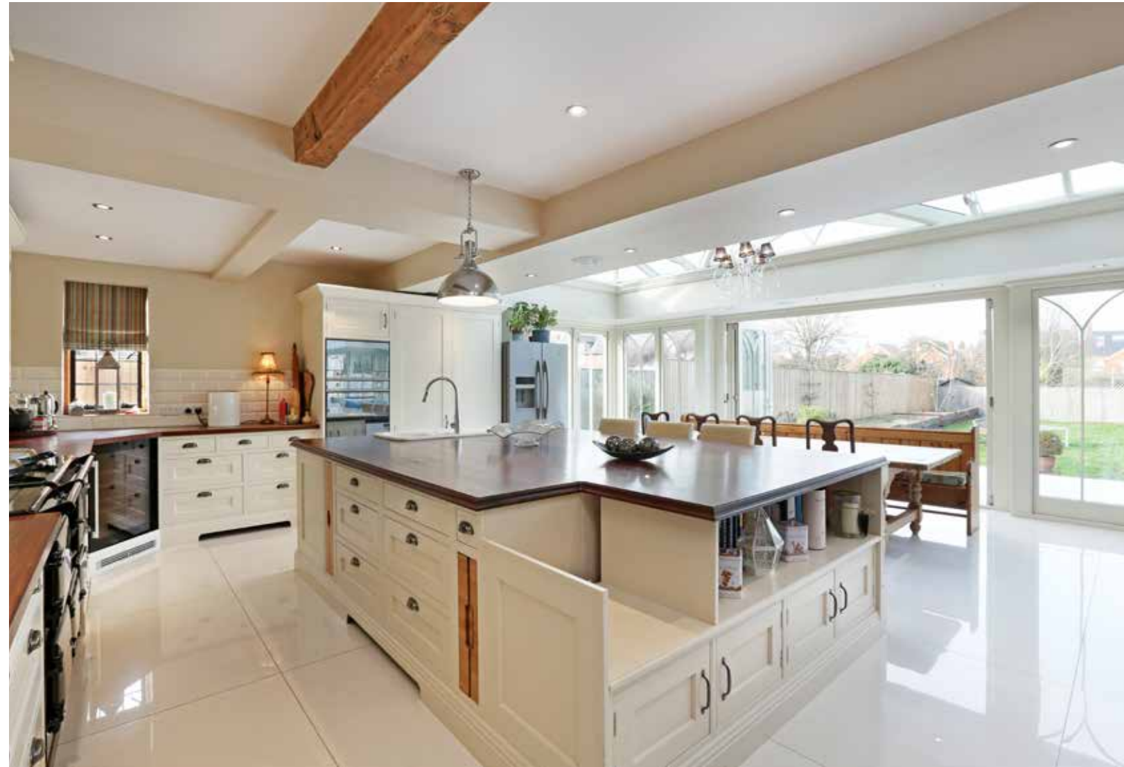
A stunning addition to this customer's home, whilst making a statement in style, this contemporary orangery kitchen extension in Maidenhead, Berkshire hits all the right notes. Acting as a kitchen, dining area and living room in a well-designed, open plan format.