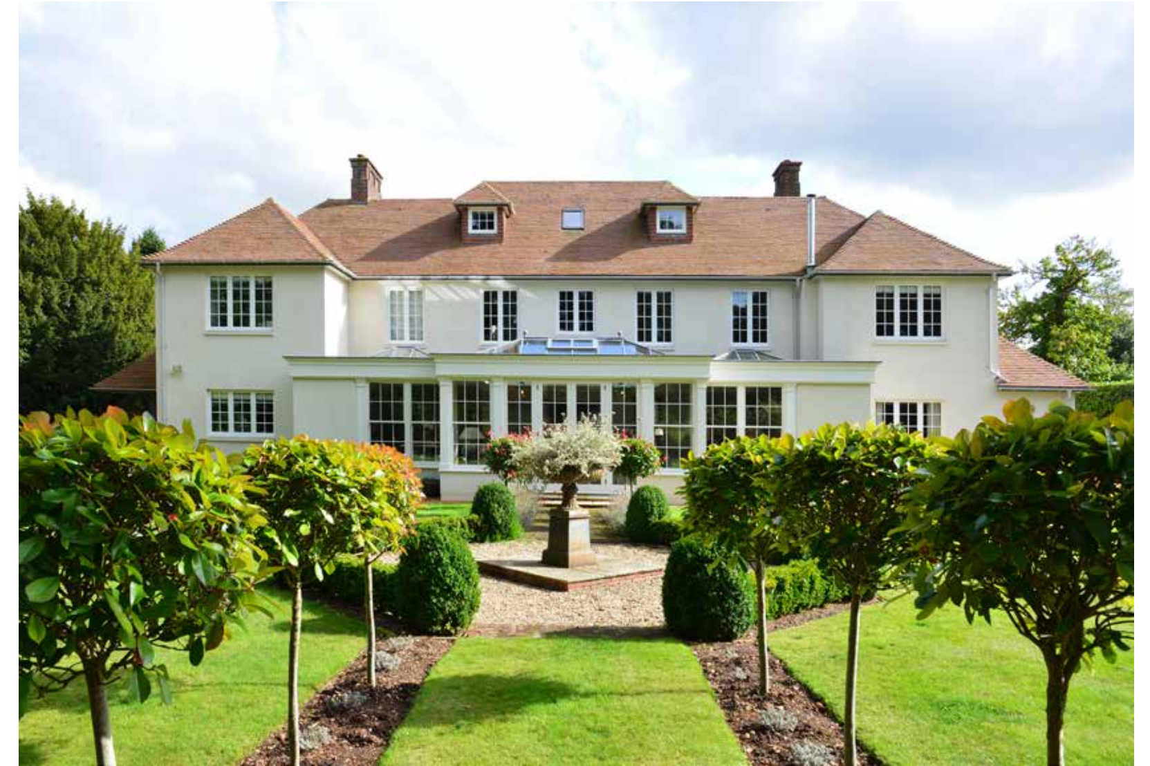
This contemporary orangery design is another beautiful example of our work blending seamlessly with the existing home. The triple lantern roofs provide an abundance of natural light throughout this orangery which, alongside the client's impeccable taste in modern interiors, has created a stunning new living space.