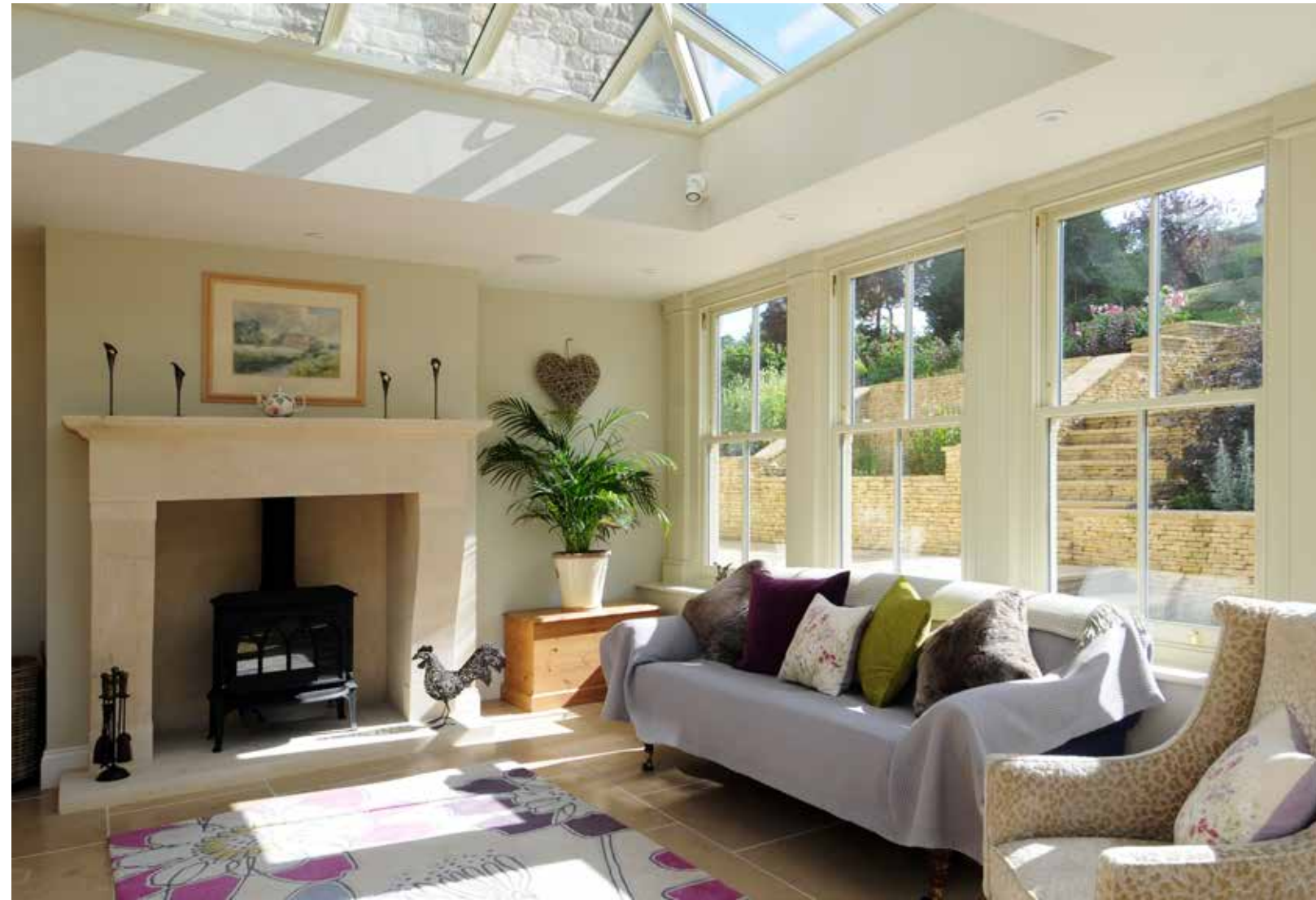
This generously sized orangery was designed to create a light living room with a fireplace, to be used as a casual family room all year round. It incorporates traditional vertical sliding sash windows, providing fully flexible ventilation options.