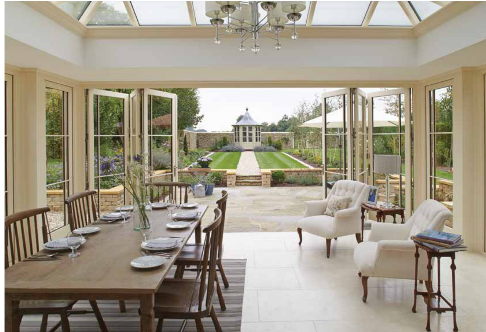
With ample room for formal dining, as well as a lounge area, this impressive extension to a busy family home gives relaxed views of the gardens. By providing the perfect transition between outside and in, this roomy structure is in constant use.