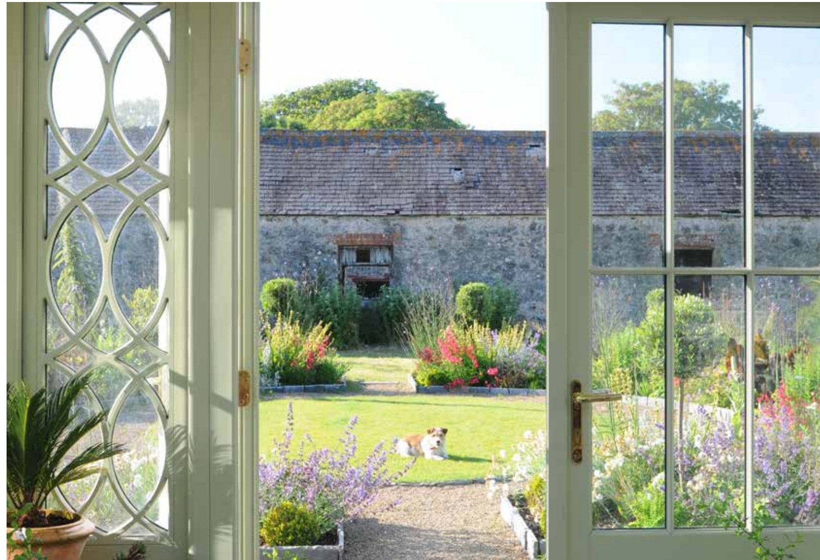
A free-standing orangery that echoes the garden's extensive stone works makes the perfect addition. Its unpretentious, naturalistic design is sensitively in keeping with the existing outbuildings and surrounding woodland.