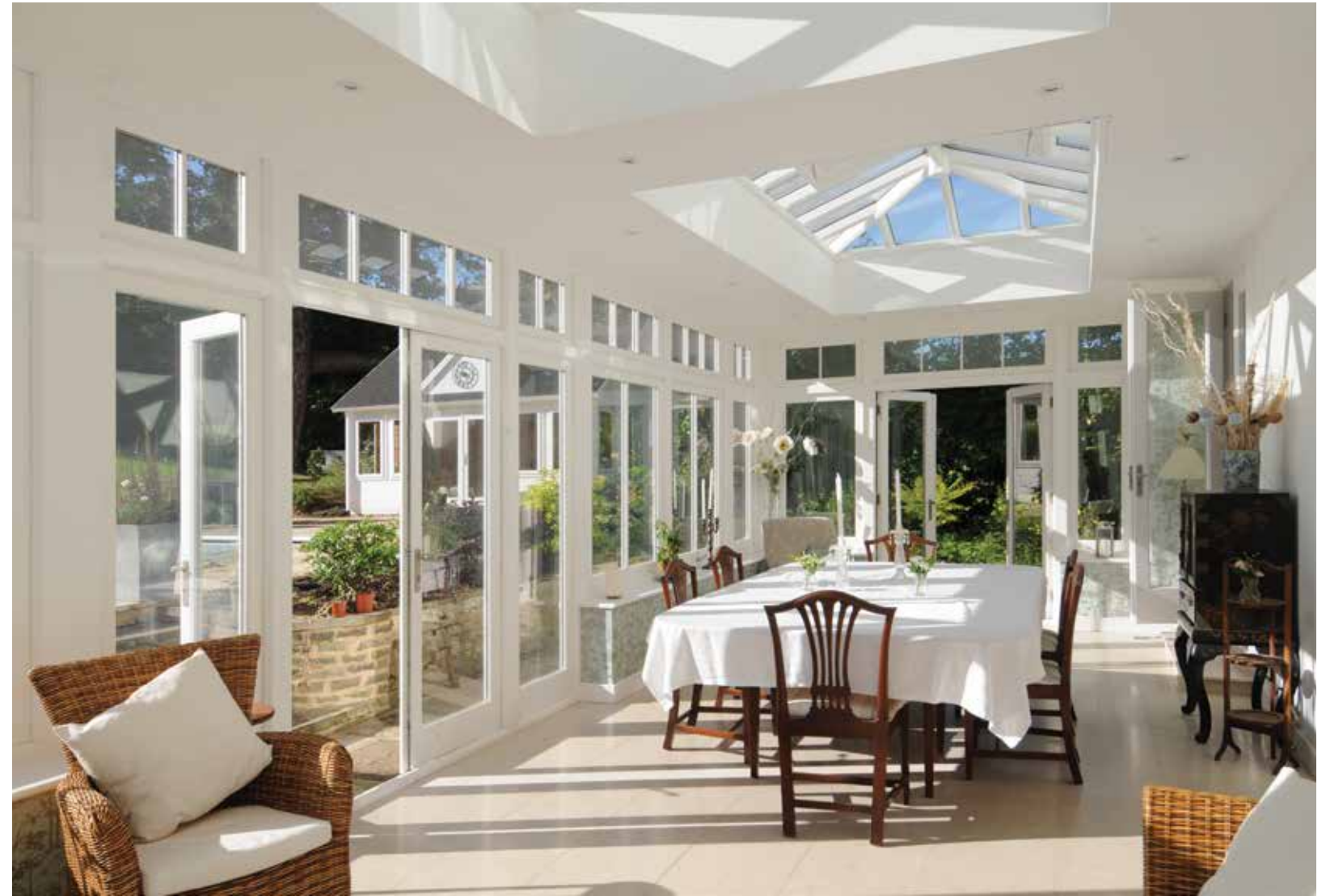
With ample room for formal dining, as well as relaxed lounging, this impressive extension to a busy family home gives panoramic views of the gardens, as well as overlooking the pool. By providing the perfect transition between outside and in, this roomy structure is in constant use throughout the year.