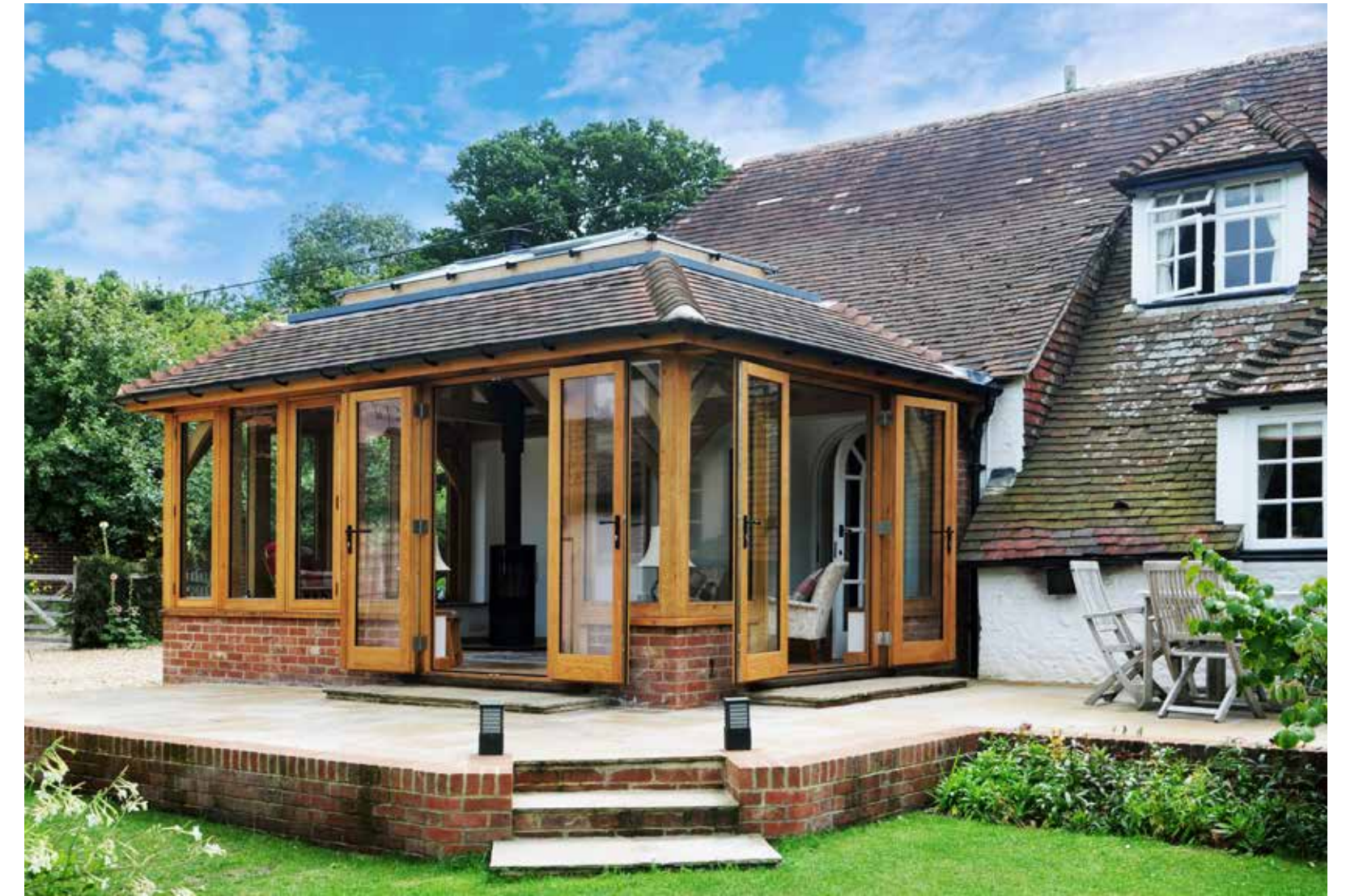
This attractive oak orangery is a perfect fit to the original cottage. The internal oak beams really add extra character to the home, whilst the free-standing wood burning stove was added to give the room a focal point.