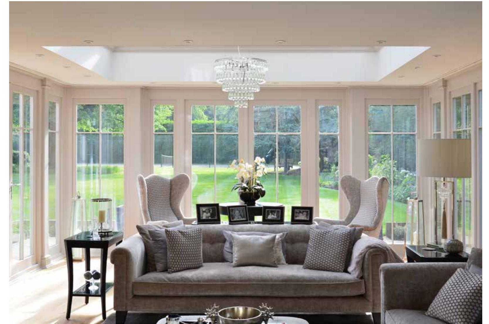
With a brief to create a "larger living room," this beautiful painted orangery has definitely created a 'room for living'. Adding in more natural light and opening up the gardens, the outside is now easily accessible, and provides that feeling of indoor/outdoor living that really only comes with an extension like an orangery or garden room.