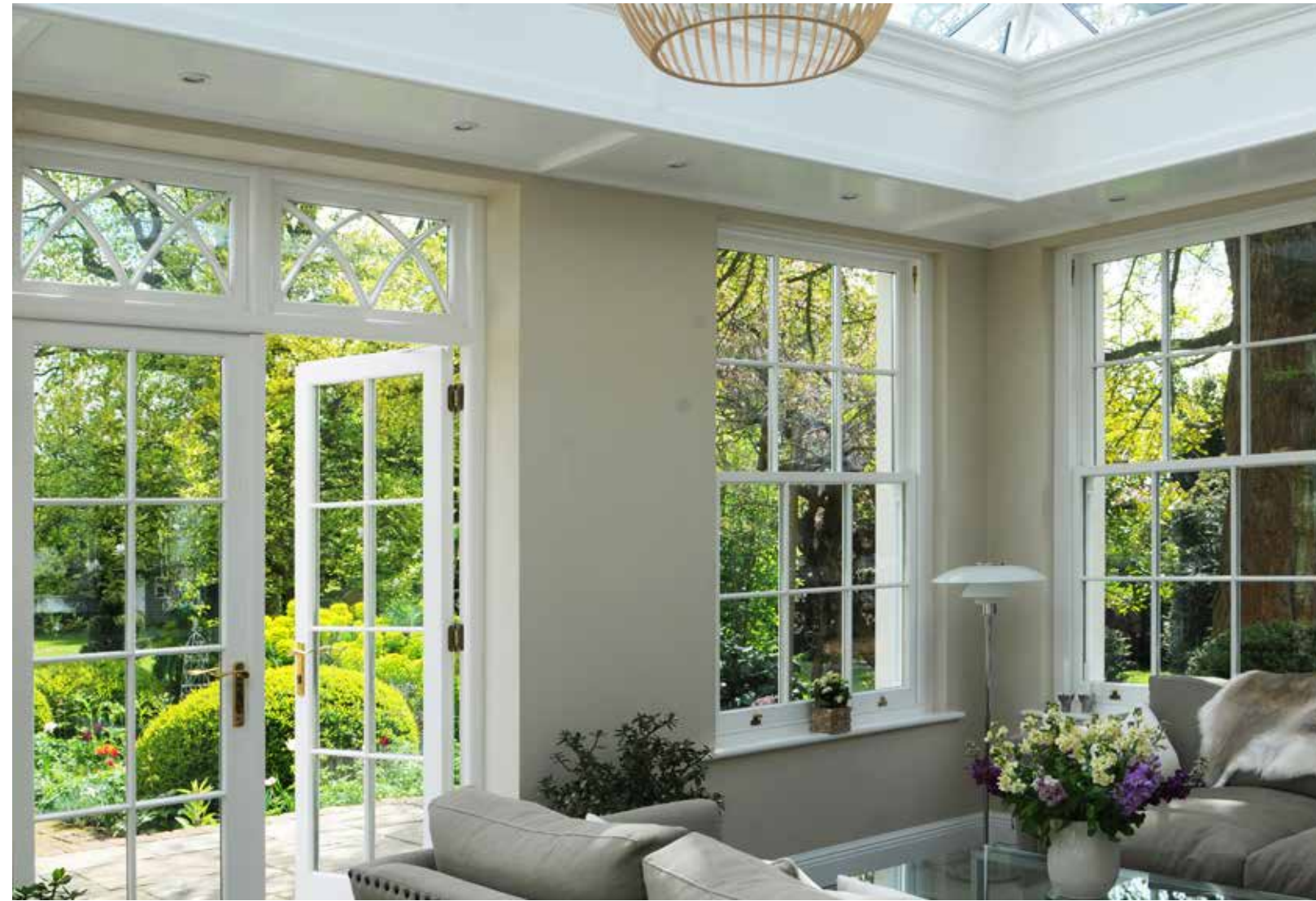
This traditional orangery design is relatively rare today but is quintessentially what orangeries are all about. On the back of this Grade II Listed Building, it has large vertical sliding sash windows set into solid walls with a flat roof and a glass lantern – it works perfectly in harmony with the existing property.