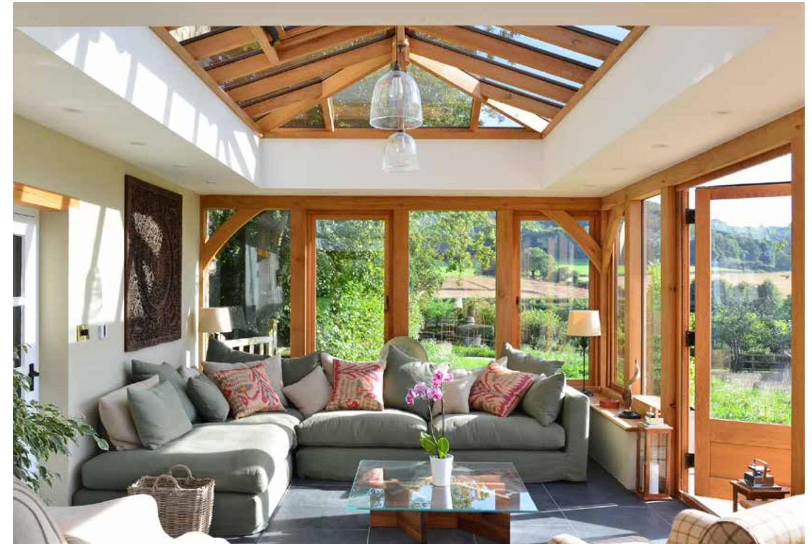
This well designed orangery makes the most of the magnificent views and the surrounding countryside. The spacious and light-filled living room is now enjoyed by the whole family.