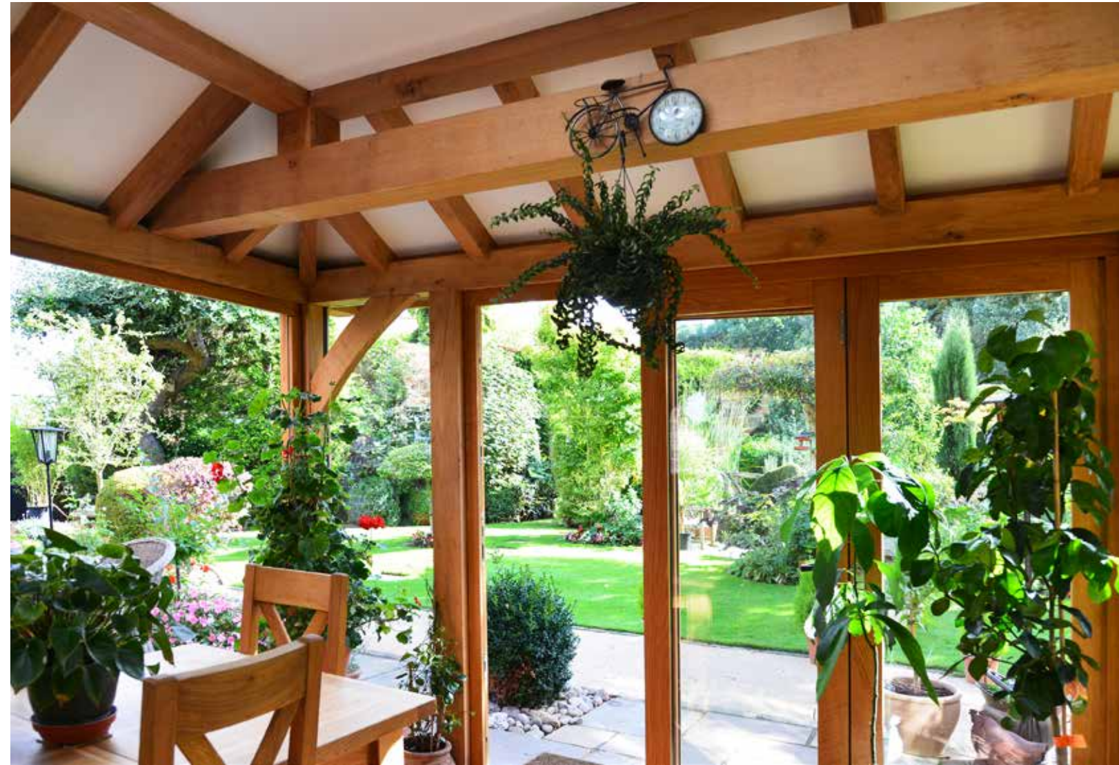
This 'Mansard Roof' oak garden room is by no means the grandest, but it is one of the most beautiful oak buildings we have completed. It is perfectly proportioned for the setting and provides a natural link into the garden, as though it has always been there.