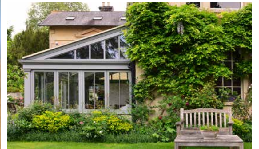
Responding to the brief to bring a taste of the beautiful outside to the inside of this Listed Building in Bath, this painted garden room blended seamlessly with our client's existing home.