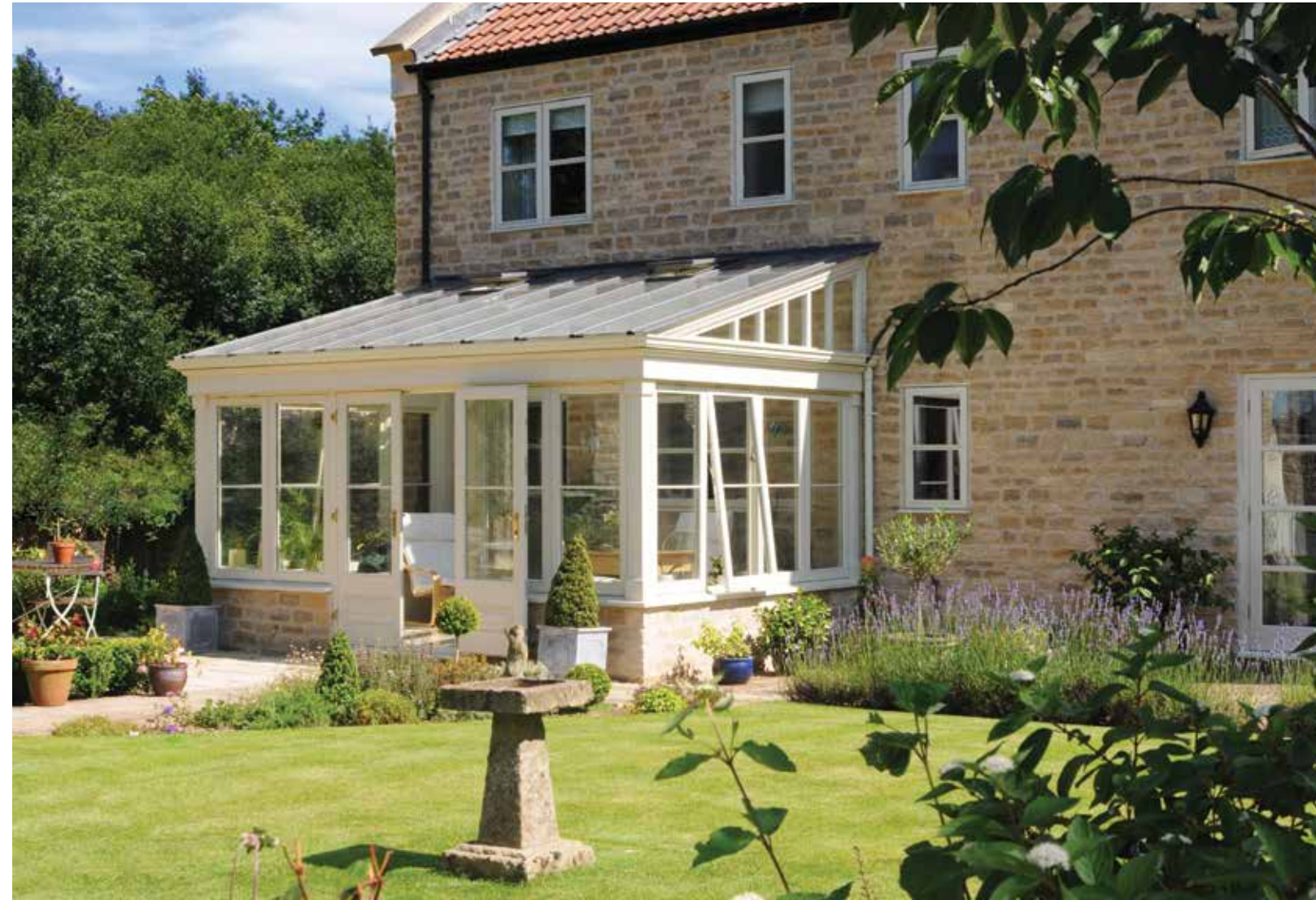
This conservatory enables a profusion of natural light into the home. This design sits perfectly with the style of the house and provides a relaxed environment that our clients use all year round.