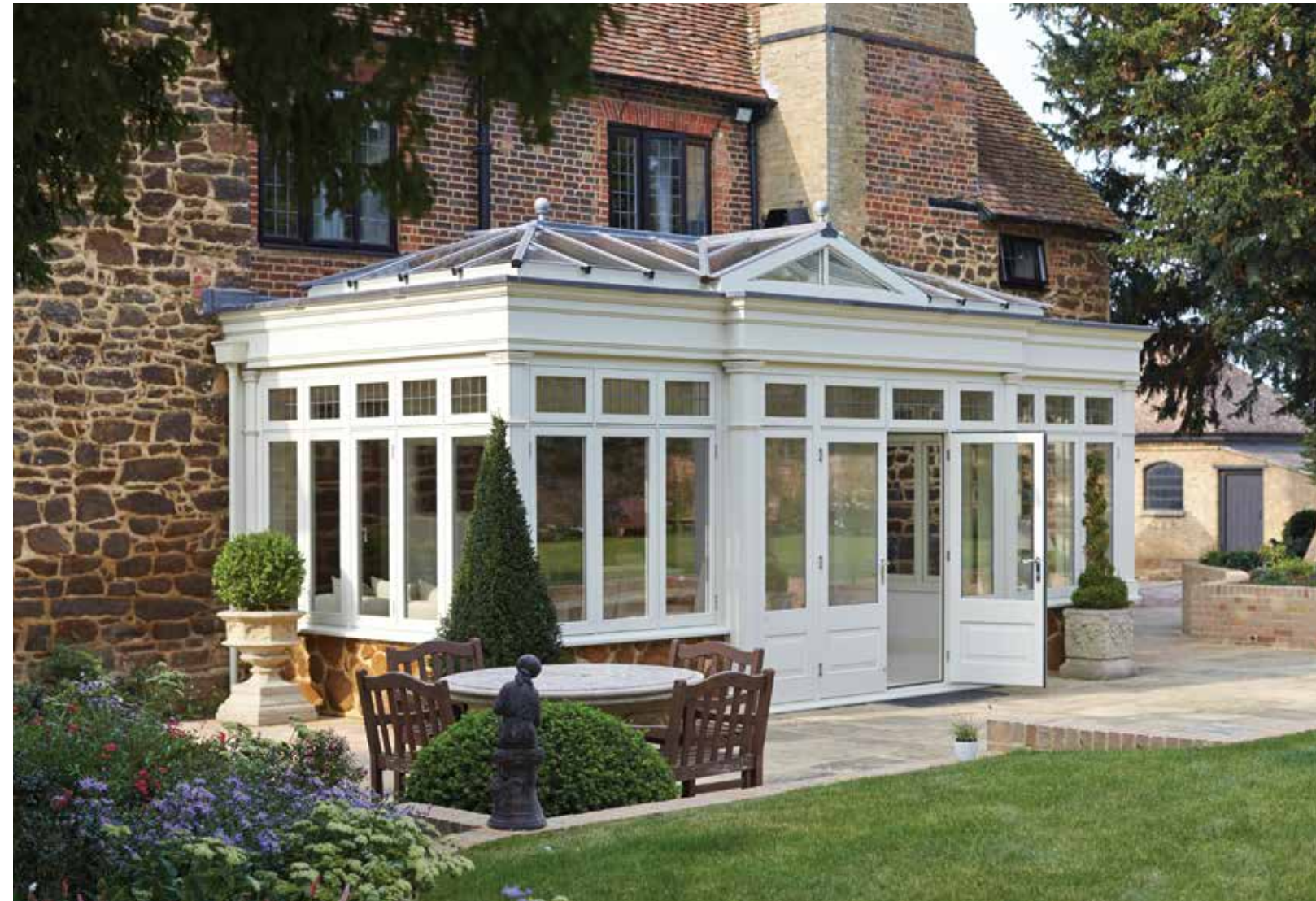
The addition of a David Salisbury orangery has delighted the owners by bringing sunshine into the home. It has opened up the ground floor to create a beautiful sunny dining area, with open plan access to the kitchen.