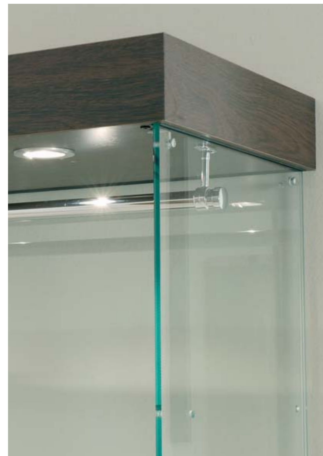
Detail of the clothes hanger bar