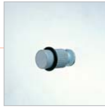
Art. RL Shelf holder