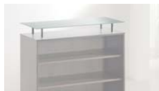
art. 50/TOP Glazed glass top