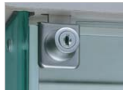
art. SA Lock for single door