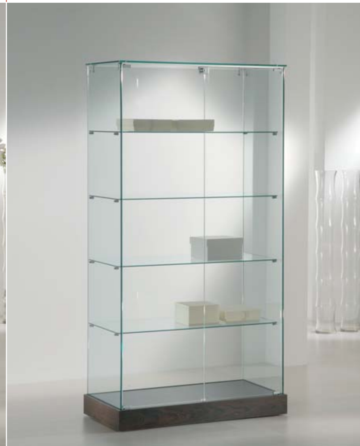
art. 130/CC - (cm 73 x 46 x 180h) art. 130/CS - (cm 93 x 46 x 180h)