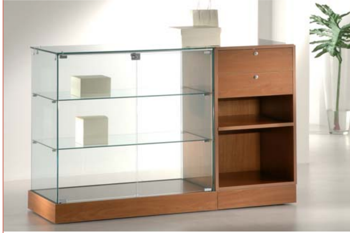
art. 162/M - (cm 50 x 46 x 90h)