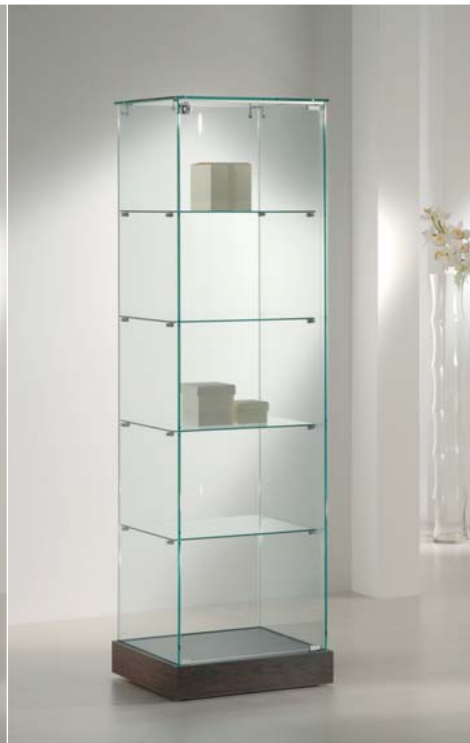
art. 180/ES - (cm 53 x 46 x 180h)