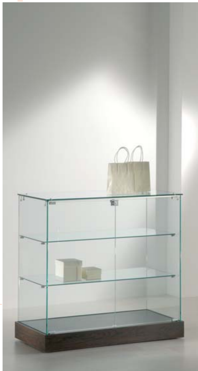
art. 20/AC - (cm 73 x 46 x 90h) art. 20/AS - (cm 93 x 46 x 90h)