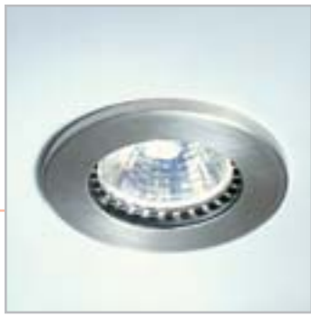
Art. 35/FA Halogen spot light 35w