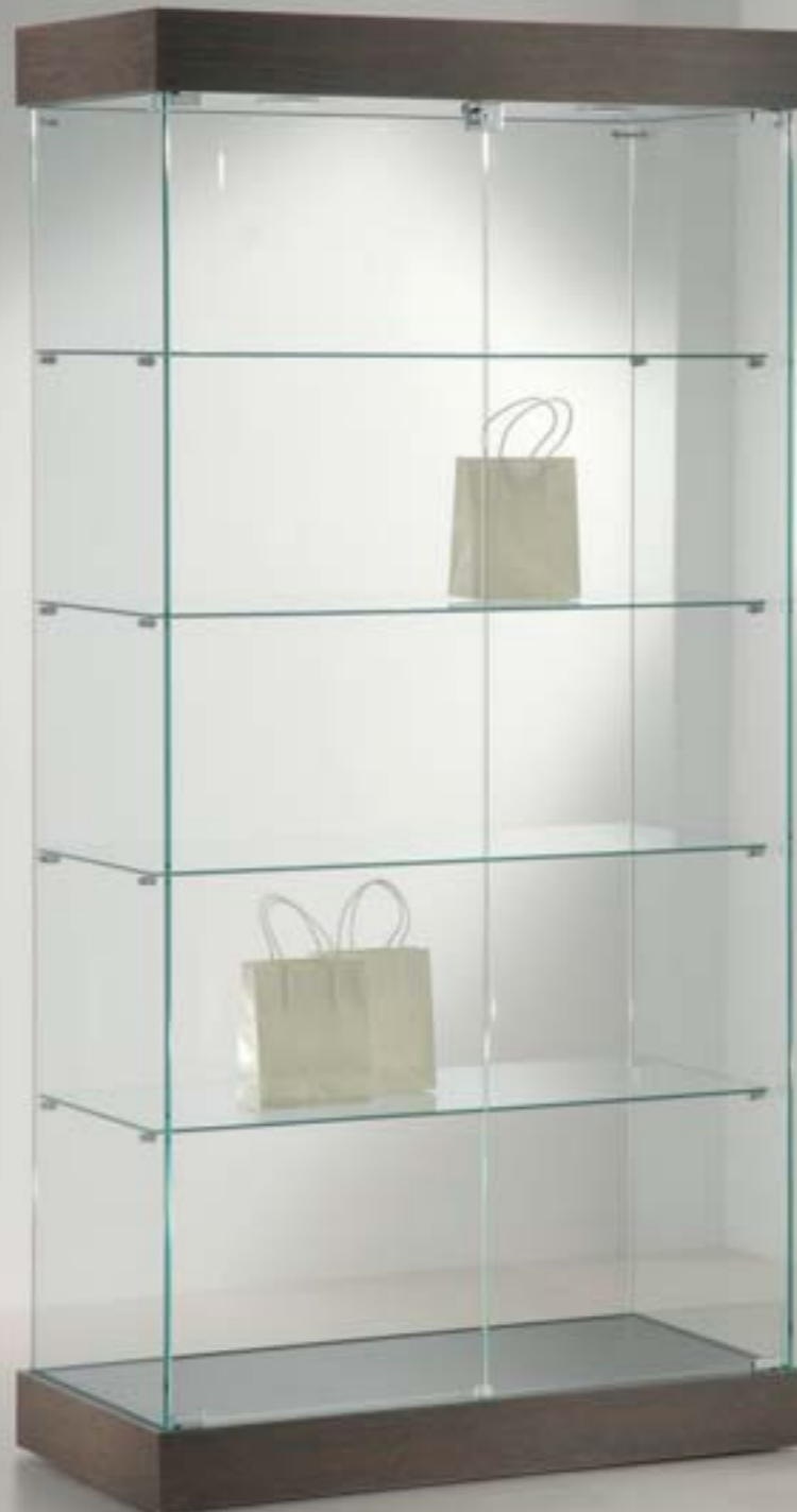
art. 131/CC - (cm 73 x 46 x 188h) art. 131/CS - (cm 93 x 46 x 188h)