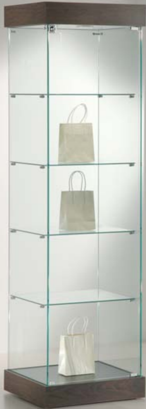
art. 181/ES - (cm 53 x 46 x 188h)