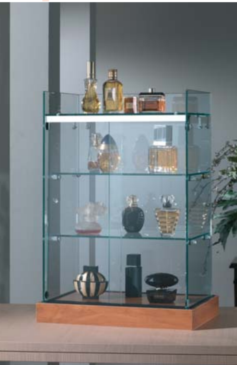
art. 190/F - (cm 40 x 27 x 60h)