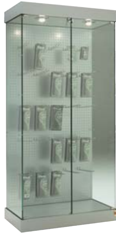
C code: 131/BL