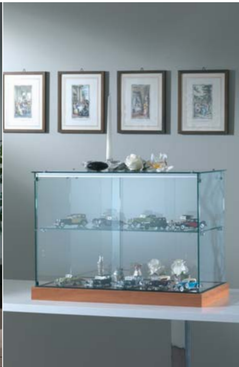
art. 190/B - (cm 71 x 35 x 50h)