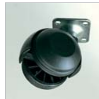
Art. RU Castor -80 Kg. capacity