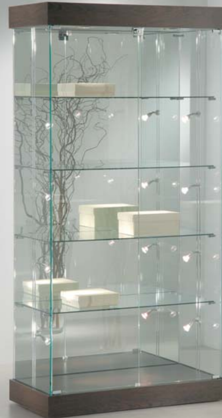
Example of art. 131/CC with mirror back glass (art. 68/SP) and side lighting (art. 4/AV - 2 sides)