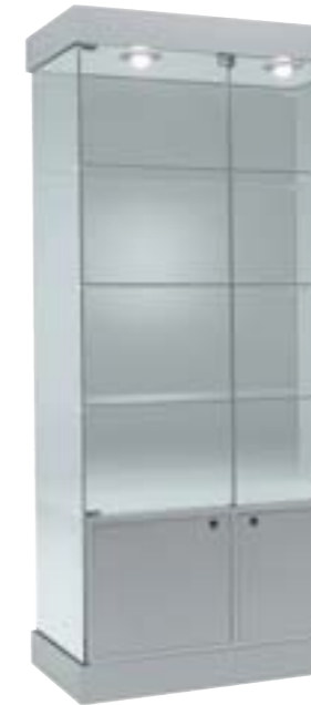
E code: 121