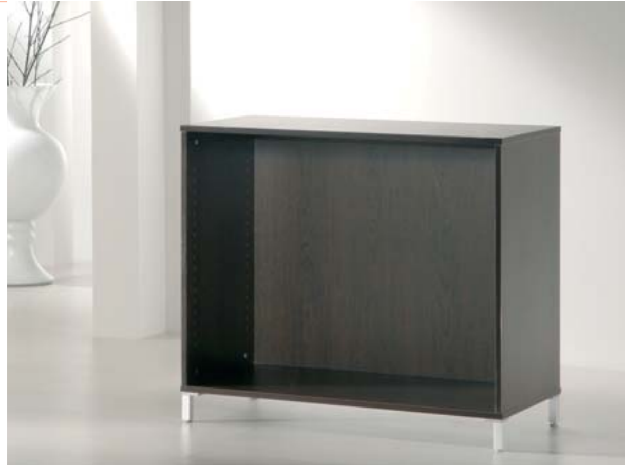
art. 50/B - (cm 100 x 46 x 90h)