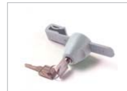
art. SC Rack lock for sliding doors