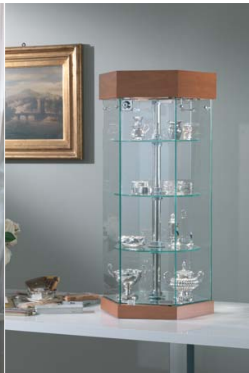
art. 221/ER - (cm Ø 36 x 74h) Electric rotating shelves