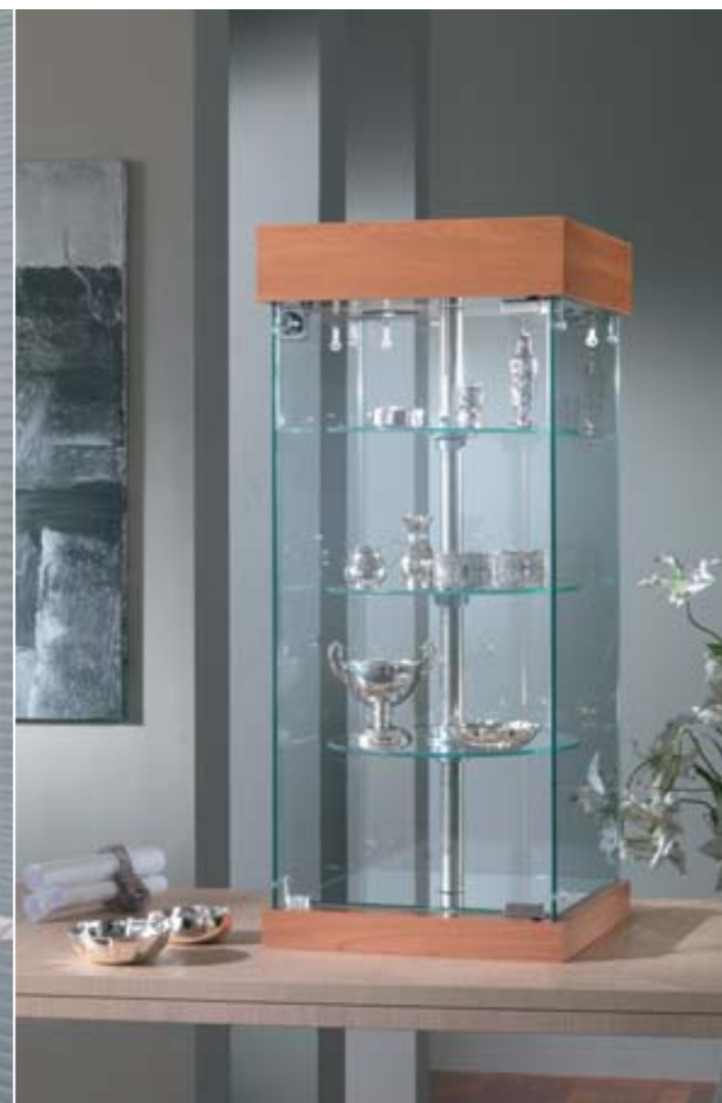
art. 201/RQ - (cm 31 x 31 x 74h) Electric rotating shelves