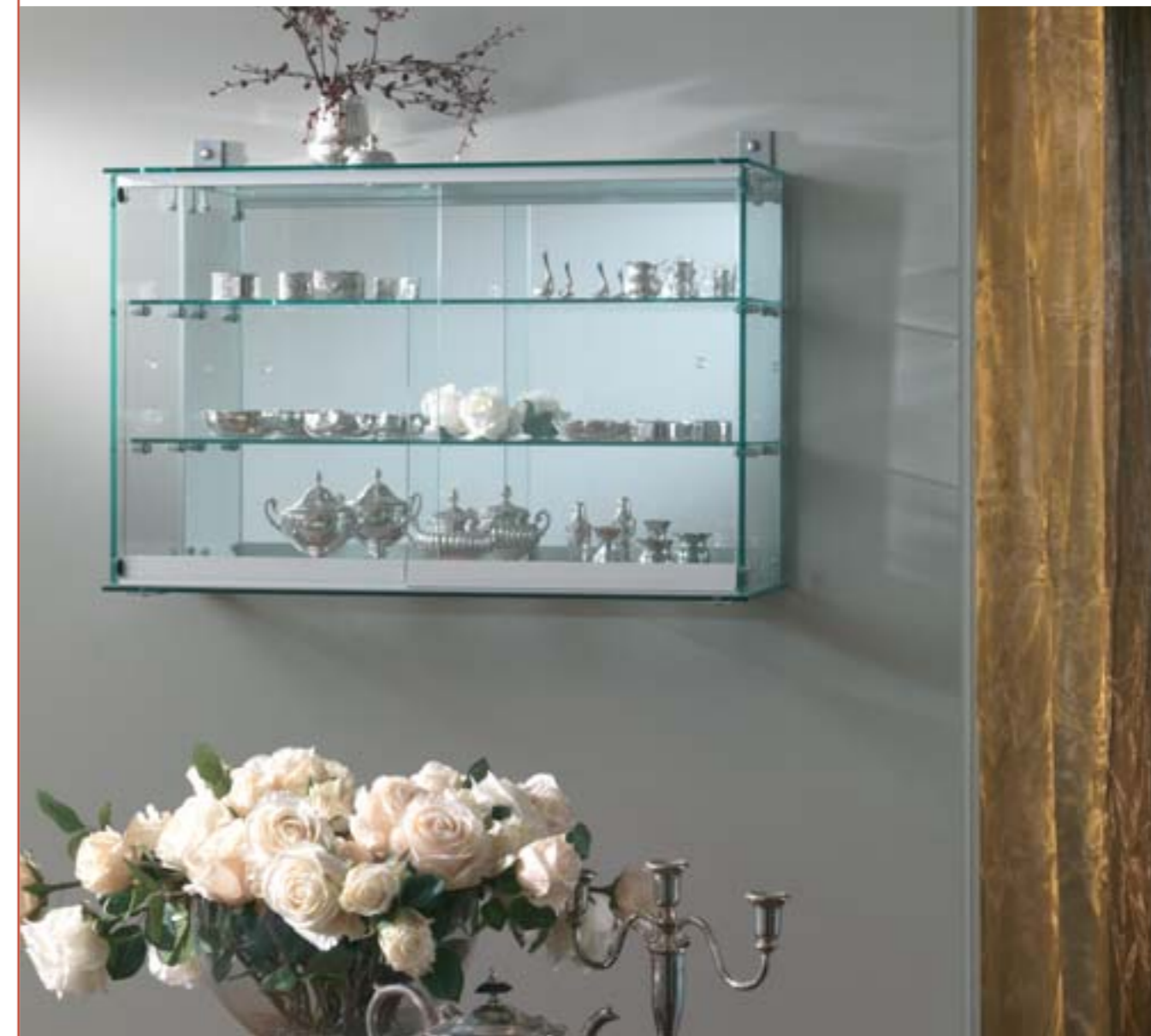
art. 200/F - (cm 78 x 25 x 55h)