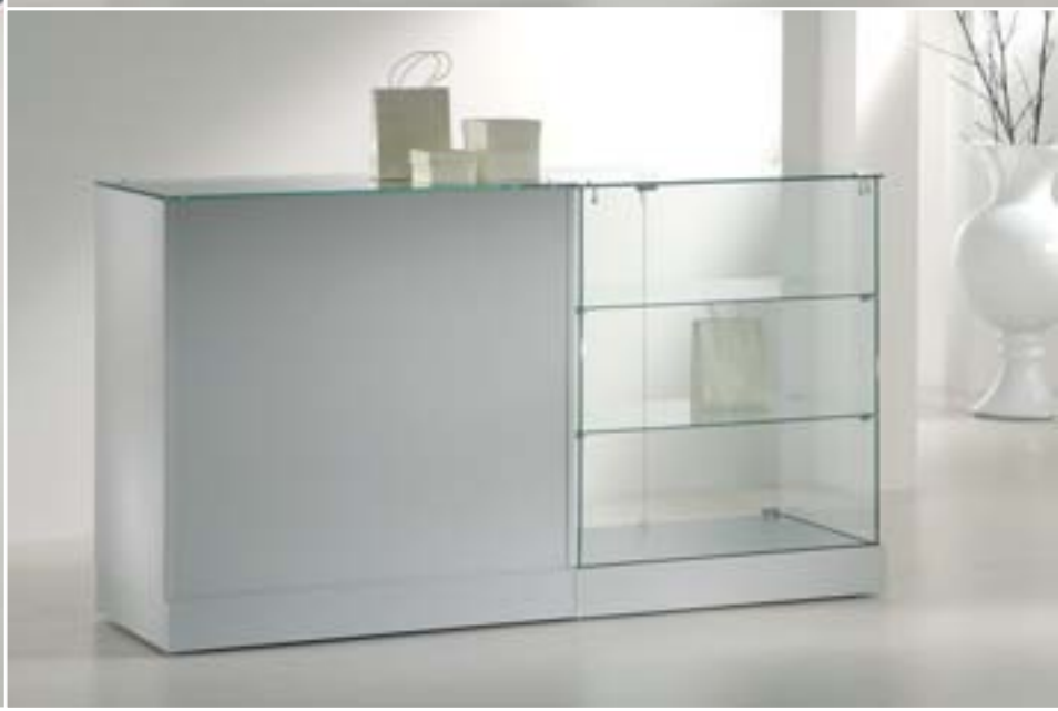
art. 162/MG - (cm 88 x 46 x 90h)