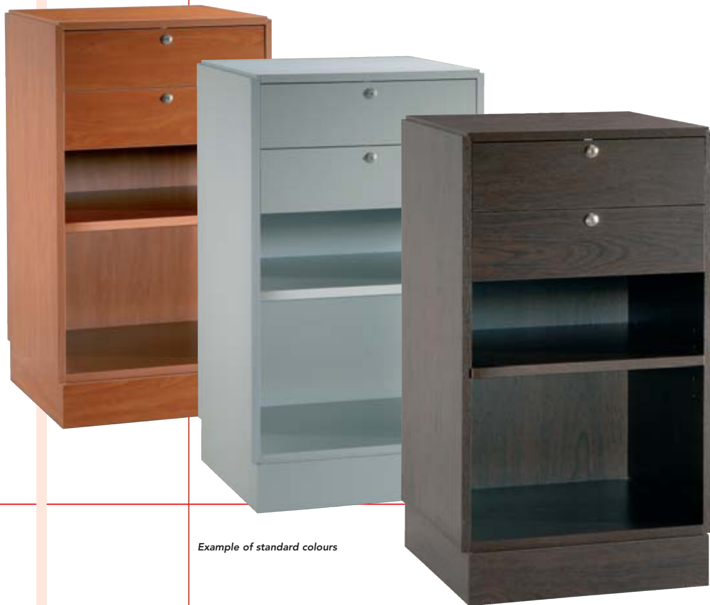
Example of standard colours