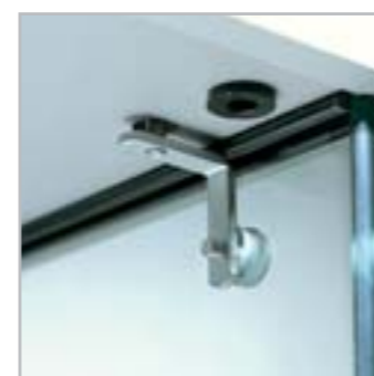
Art. 2/AP 2-way angular (flat) fixing bracket