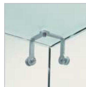
Art. 3/AN 3-way angular fixing bracket