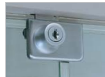
art. SA/2 Lock for double door