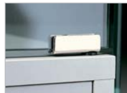
art. CE Hinge