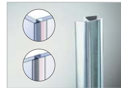
art. PA Anti-dust profiles.