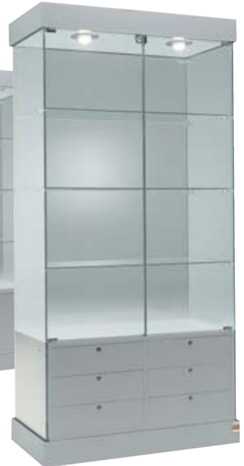
F code: 101