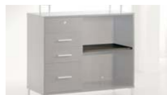
Art. 50/MC Short shelf