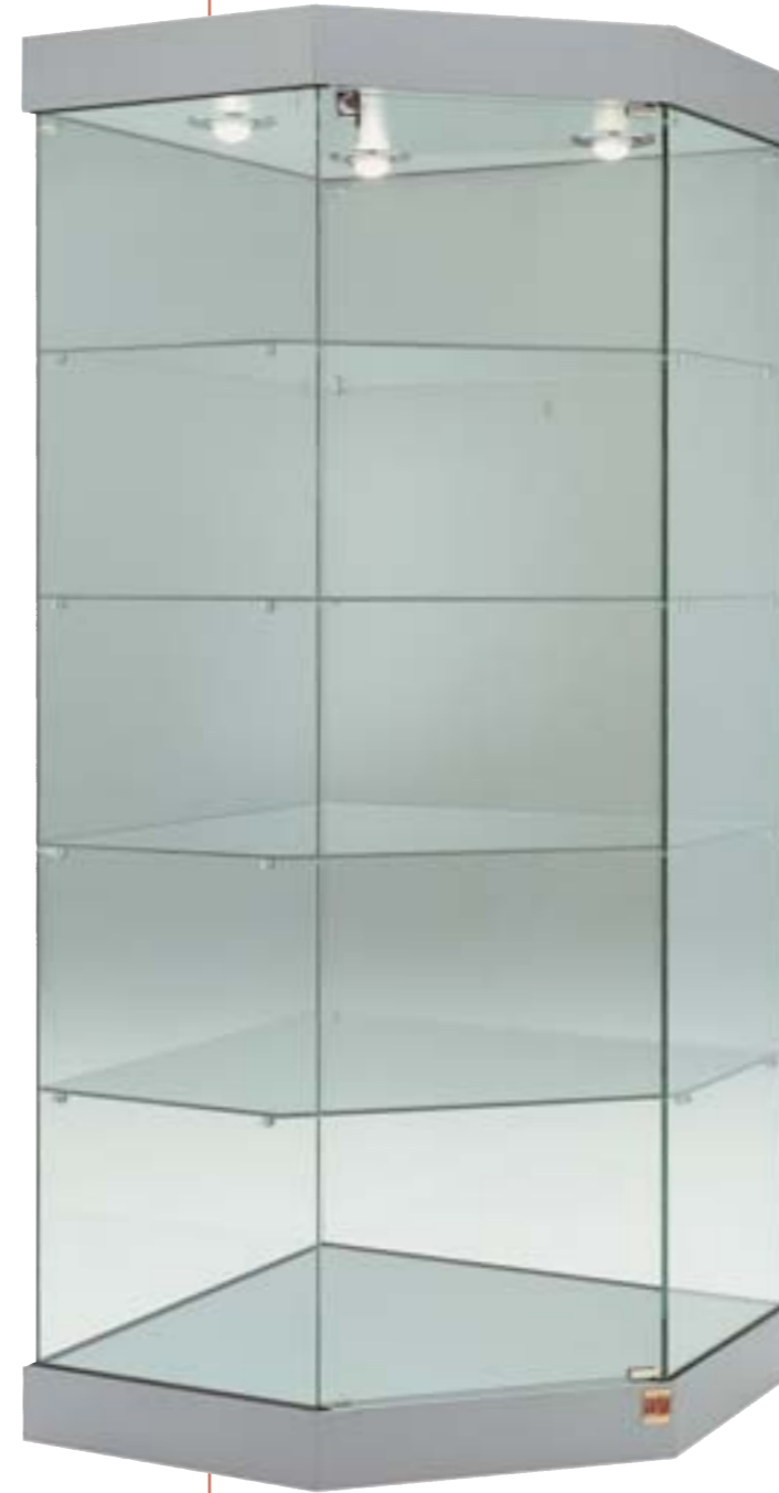
D code: 191