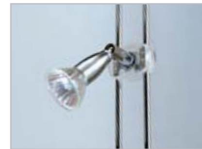
art. 1/AV Halogen spot light to light up each single shelf