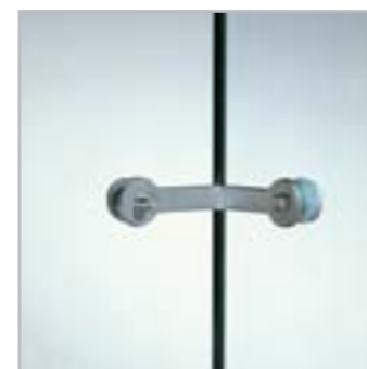
Art. 2/AN 2-way angular fixing bracket