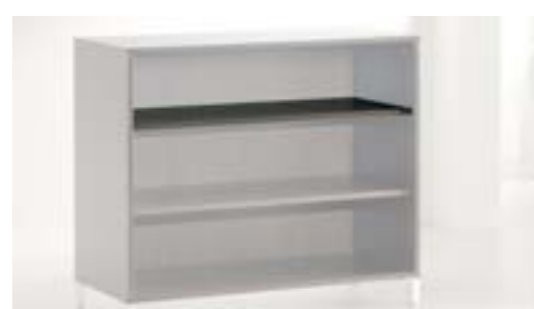
Art. 50/ML Long shelf