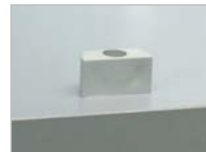
art. FA Door stopper