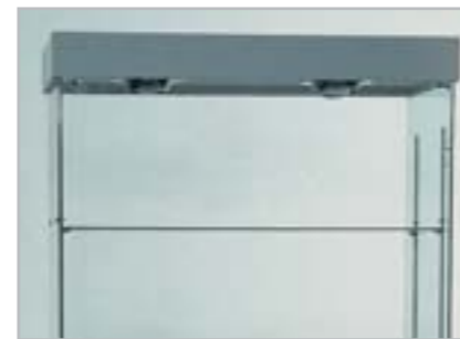
art. CR/92 - CR/140 - CR/180 Slide-system for adjustable shelves