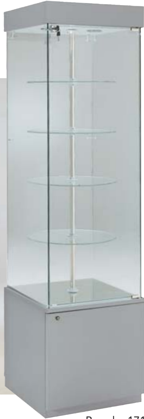
B code: 171/R