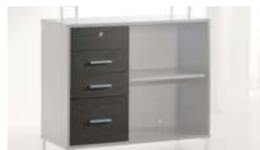
Art. 50/C Drawers