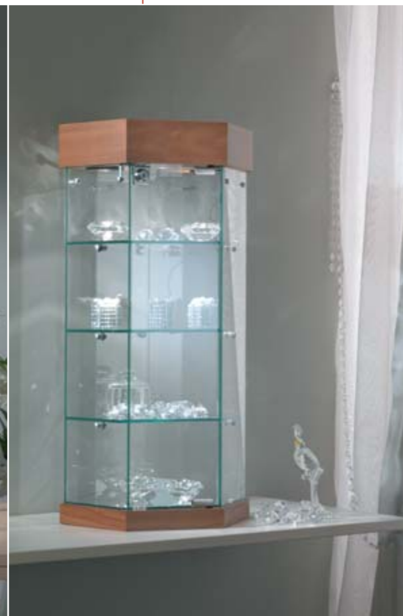
art. 221/E - (cm Ø 36 x 74h)