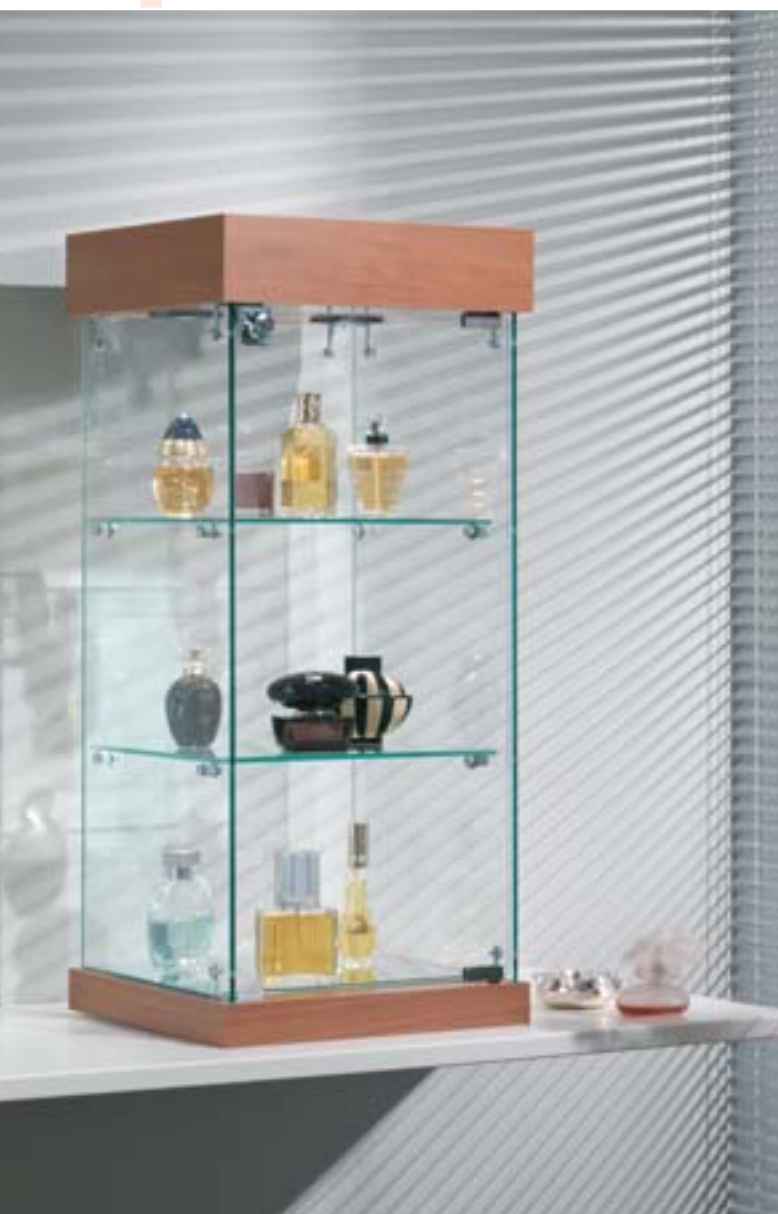
art. 201/Q - (cm 31 x 31 x 74h)