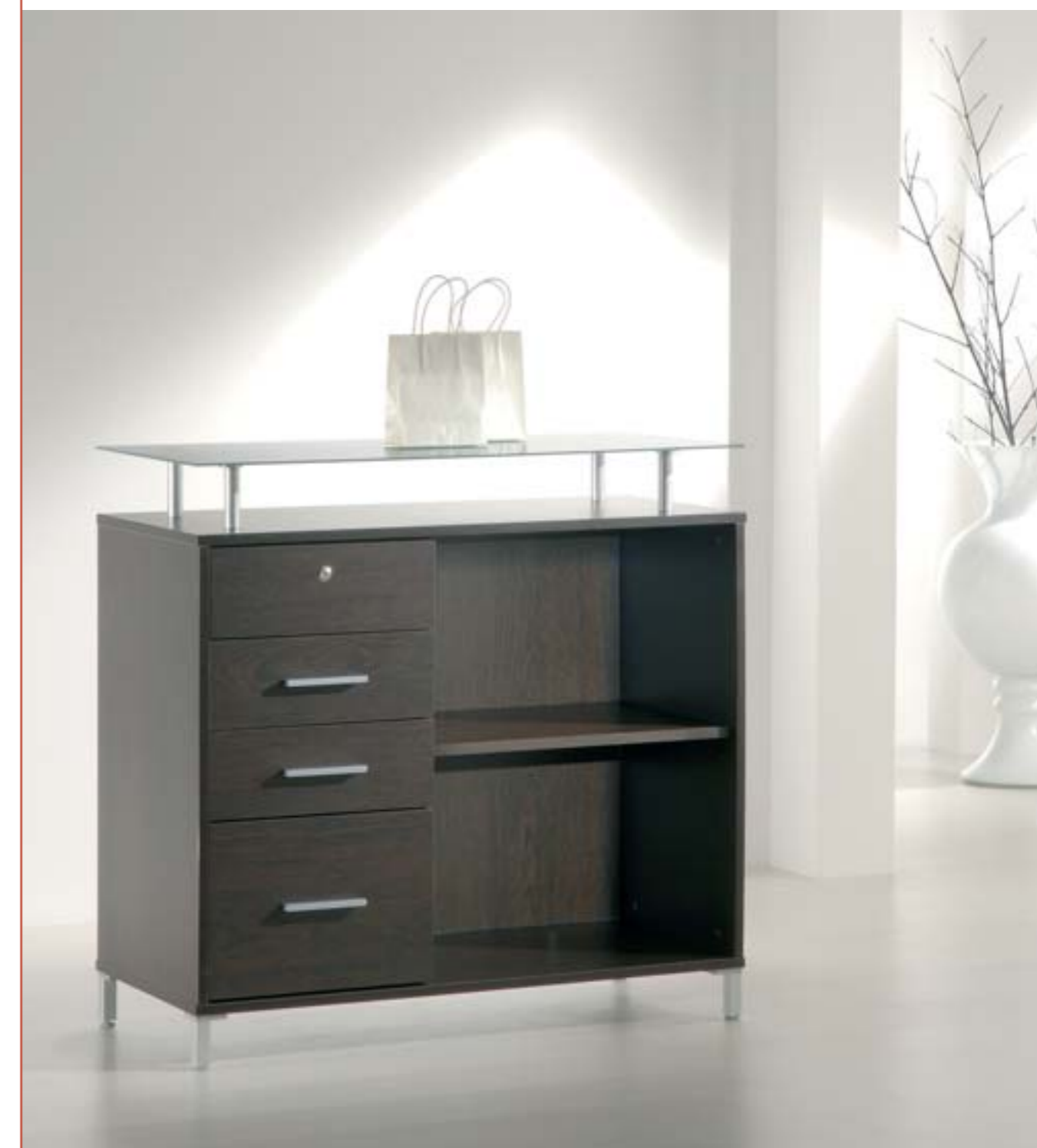
Example of counter with parts 50/B + 50/TOP + 50/MC + 50/C