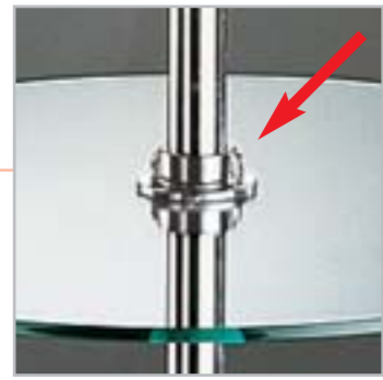
Art. RR Adjustable shelf holder for revolving pole