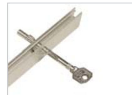
art. SS Pin lock on guide for sliding doors