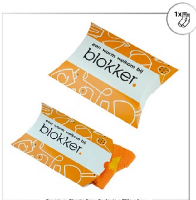
Premium Classic Crew Socks in a Pillow box