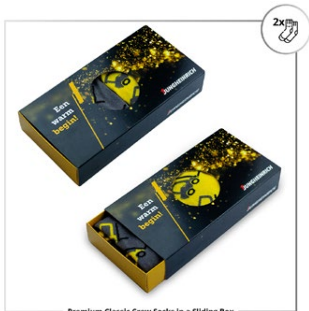
Premium Classic Crew Socks In a Sliding Box