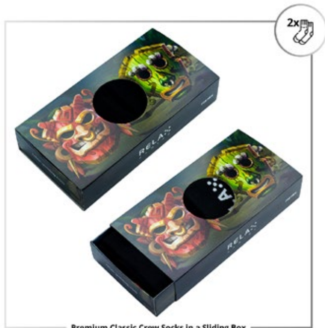
Premium Classic Crew Socks in a Sliding Box