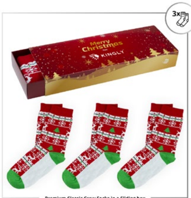
Premium Classic Crew Socks in a Sliding box