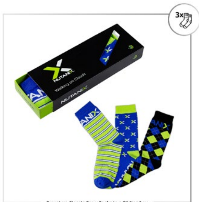
Premium Classic Crew Socks in a Sliding box