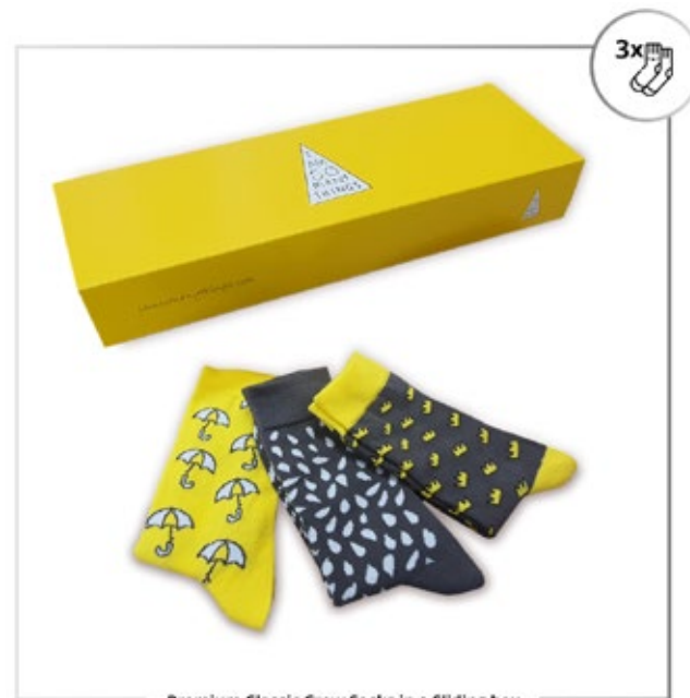
Premium Classic Crew Socks in a Sliding box