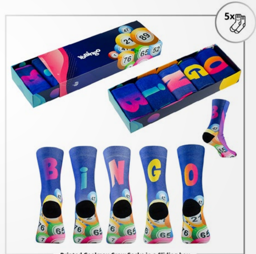
Printed Coolmax Crew Socks in a Sliding box

Composition: 90% COOLMAX for comfort and breathability, 8% polyester for strength, 2% elastane for stretch.