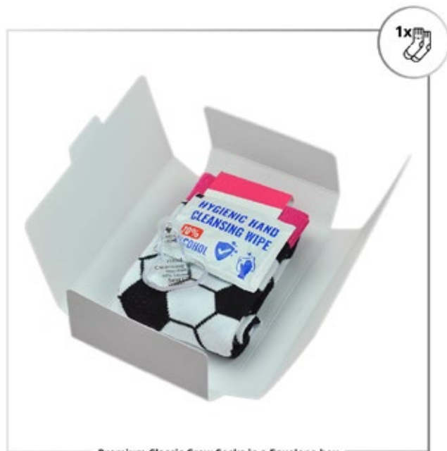
Premium Classic Crew Socks In a Envelope box