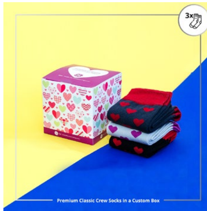
Premium Classic Crew Socks in a Custom Box