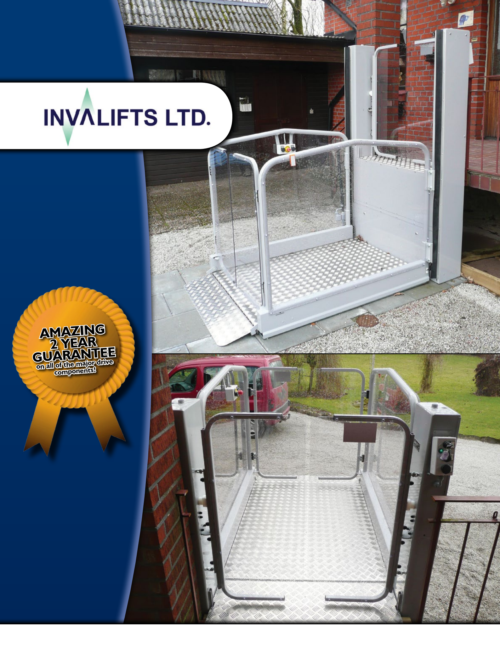
InvaFlexi - The Premier Open Type Wheelchair Platform Lift An open type wheelchair platform lift with up to 3 metres of travel.