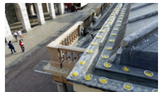
Covent Garden Building