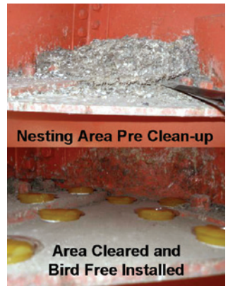
Nesting Area Pre Clean-up

...whilst on flat roofs or skylight panels, a matrix of dishes may be required to ensure that they remain a bird free zone, as shown here installed on the Roof Gardens Restaurant in Kensington, London.