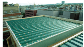
The Roof Gardens, Kensington