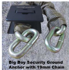
Slip your chain through