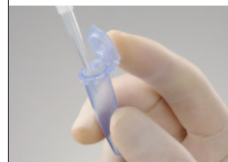
Pipetting into tube Holding cap open