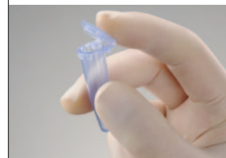
Closing cap with one hand After pipetting