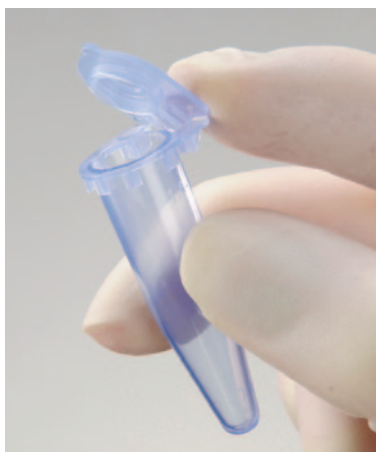
LiteTouch tube being opened With pressure on rear hinge tab