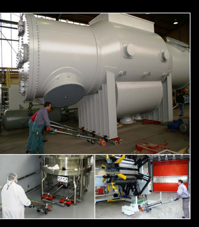
Top: 3 PowerAttacks are moving a 75 t condenser