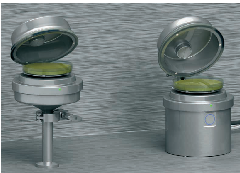
Figure 1: Two alternative ISO-90 Head options: a) mounted on pod with sanitary flange connector for quick release (left); and b) freestanding (right)

The reference sampler had been independently tested against its own