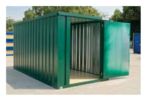
XPandaStore - Flat-packed storage unit