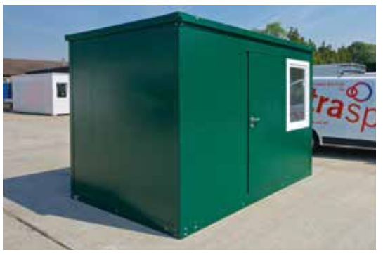
XPandaCabin - 2, 3 or 4m Flat-packed office/accomodation unit