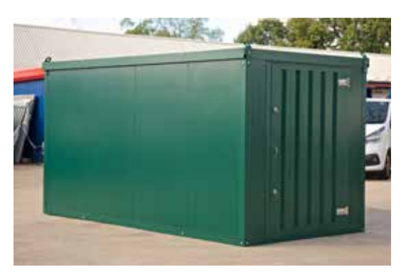
XPandaStore Insulated - Flat-packed storage unit