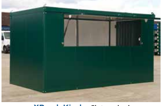
XPandaKiosk - Flat-packed storage unit with serving hatch