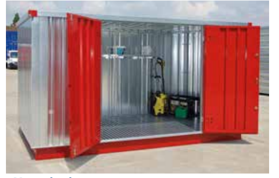
XPandaChem - Flat-packed storage unit for the safe storage of chemicals and lubricants