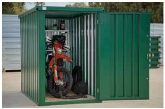
Bikestore - Flat-packed secure storage unit for cycles, motorcycles and tools