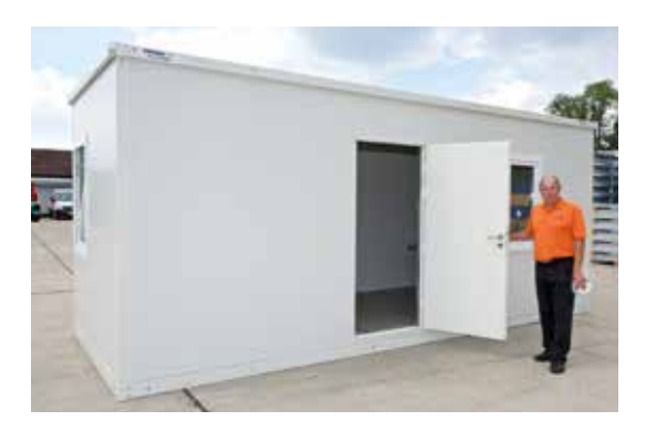
XPandaOffice - 6m Flat-packed office/accomodation unit