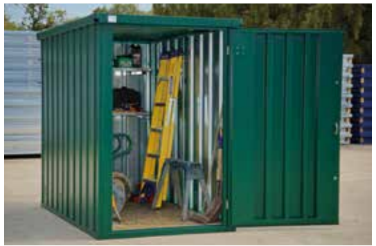
Gardenstore - Flat-packed secure storage unit for all your garden equipment