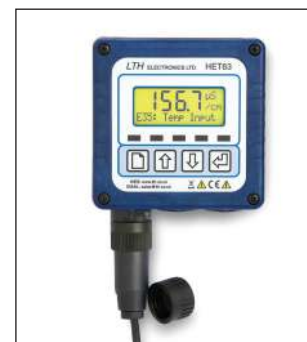
LTH dosing system