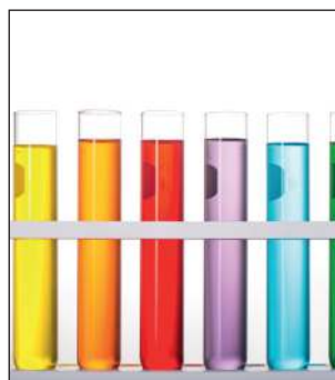
Drop test kit