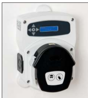
IWM chemical dosing unit