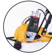
Equipped with Metabo