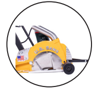
Aluminum Alloy Chassis