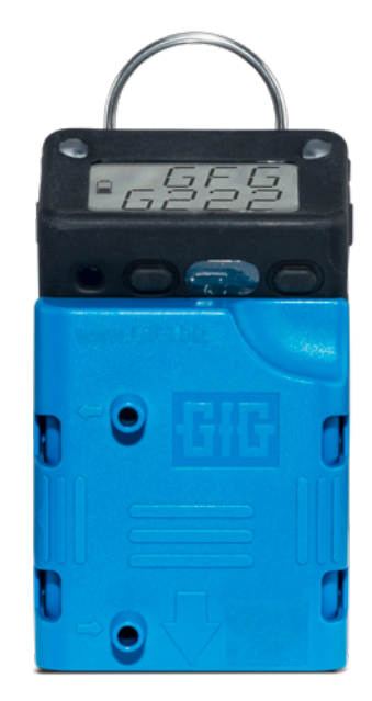
Micro 5 with Calibration Cap. Alternatively available the Smart Cap with infrared interface and mini-USB plug.

If you want to read out the content of the data logger, you will need the Smart Cap, a USB connection cable and the Config Software for the G222 series instead.