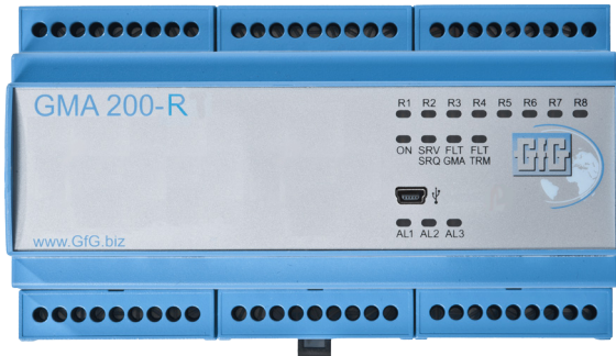
GMA 200-RT *